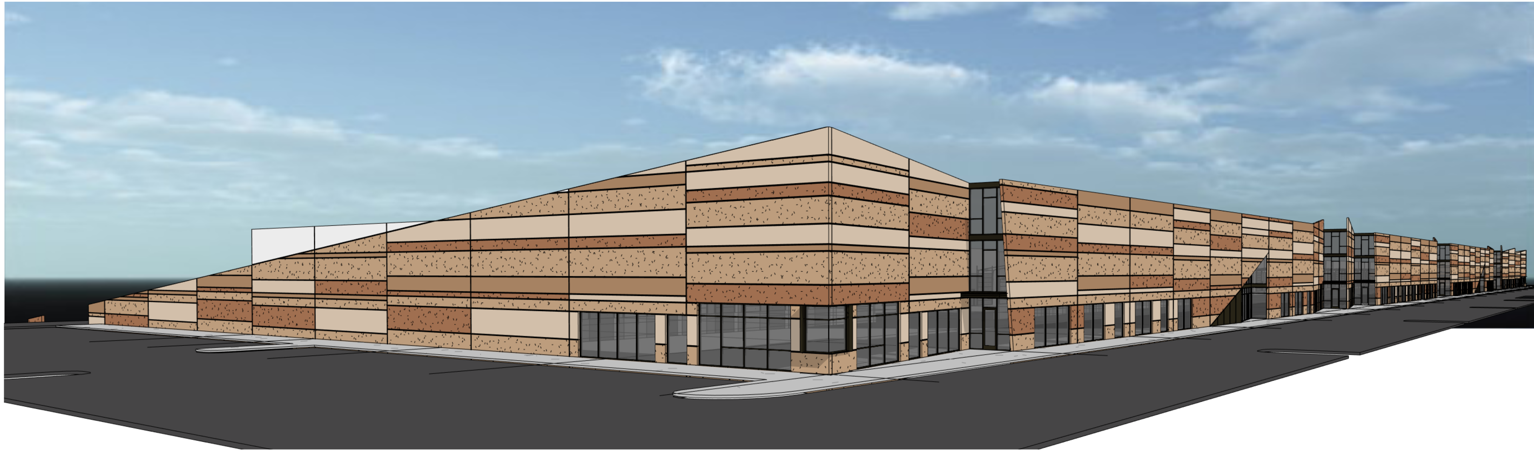
② NORTH END CAP PERSPECTIVE SCALE: 1/2" = 1'-0"

A PORTION OF THE SOUTHWEST QUARTER OF THE NORTHWEST QUARTER OF SECTION 11, TOWNSHIP 11 SOUTH, RANGE 67 WEST OF THE SIXTH PRINCIPAL MERIDIAN, COUNTY OF EL PASO, STATE OF COLORADO