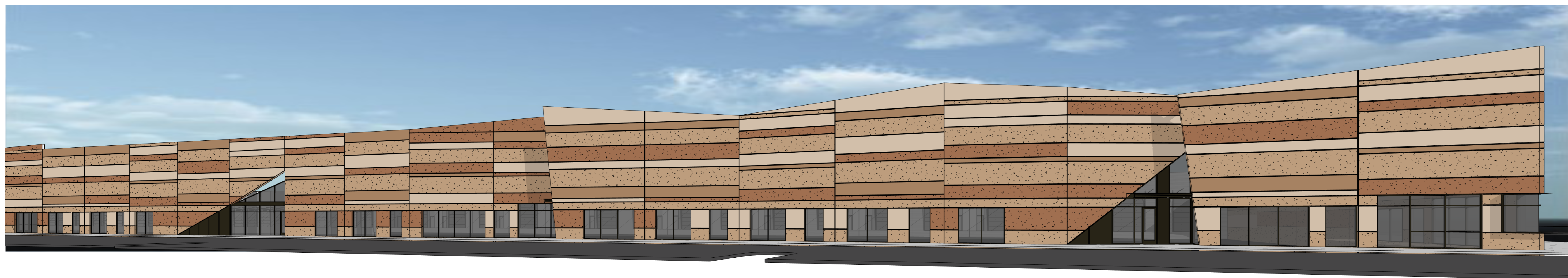
① SOUTH TENANT PERSPECTIVE SCALE: 1/2" = 1'-0"