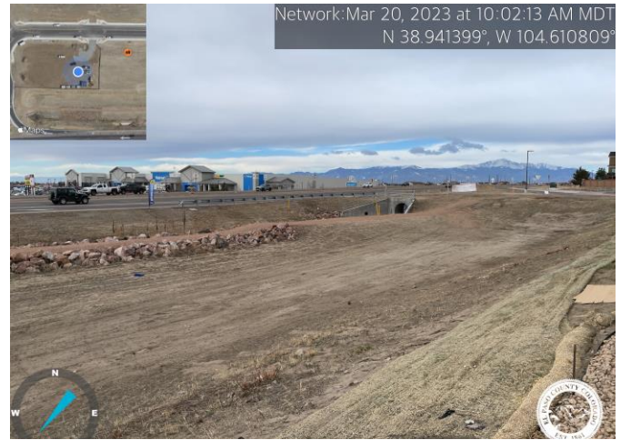
Photo 2: Implement final stabilization measures throughout bottom of pond in areas disturbed during vertical construction.