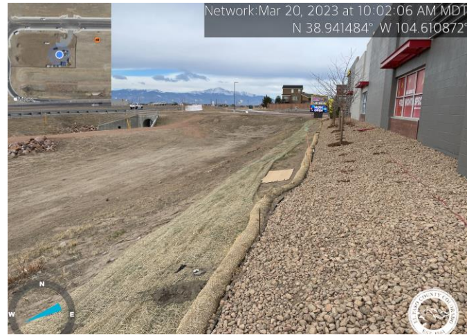
Photo 1: On south side of building: remove straw wattles and re-install erosion control blanket per detail.