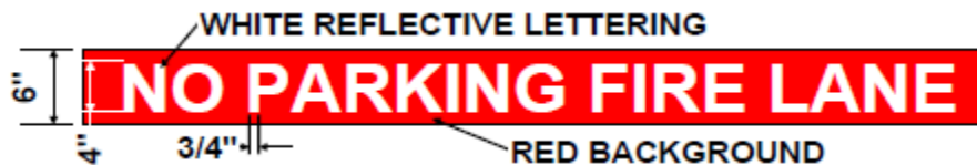
Figure D103.7. Fire Lane Striping. Add a new Figure D103.7. Fire Lane Striping. As follows:

Amend the subtitle of Appendix E to read as follows: