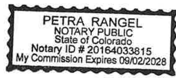
Exhibit A Exhibit B