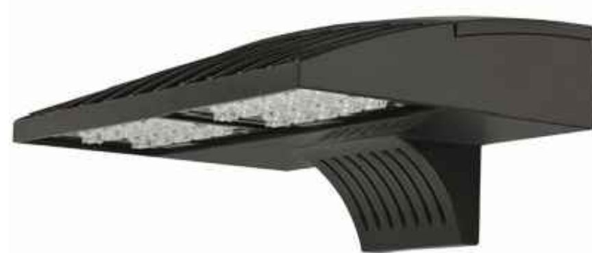
3 DSXW1 WALLPACK LUMINAIRE (WP1 & WP2) 8 SCALE: NONE