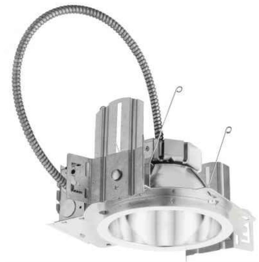
2 LDN6 LED DOWNLIGHT (DNLT) 8 SCALE: NONE

URPE PROPERTIES, LLC 7189 COLE VIEW PARCEL NO: 54081-02-043 ZONE: CS USE: OFFICE/WAREHOUSE