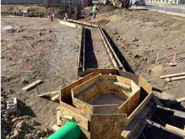
Forebay and storm detention channel