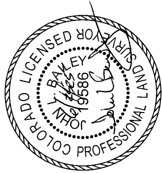
EXHIBIT 'B' BANNING LEWIS RANCH ZONE MIXED USE MEDIUM SCALE (MX-M) JOB NO. 2570.80-14 JUNE 4, 2025 SHEET 2 OF 2

619 N. Cascade Avenue, Suite 200 Colorado Springs, Colorado 80903 (719)785-0790