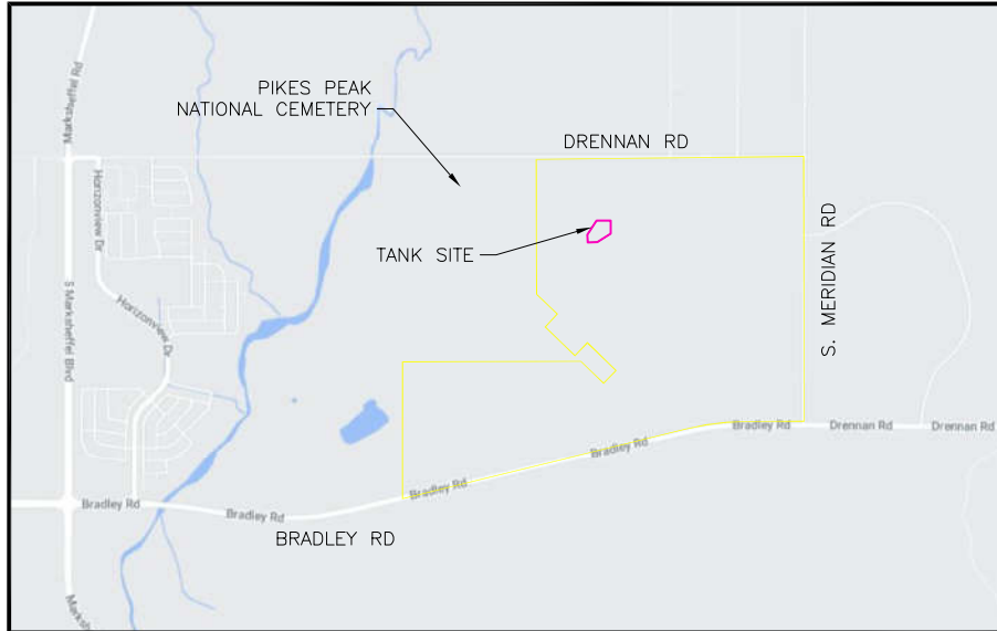
VICINITY MAP SCALE: N.T.S.