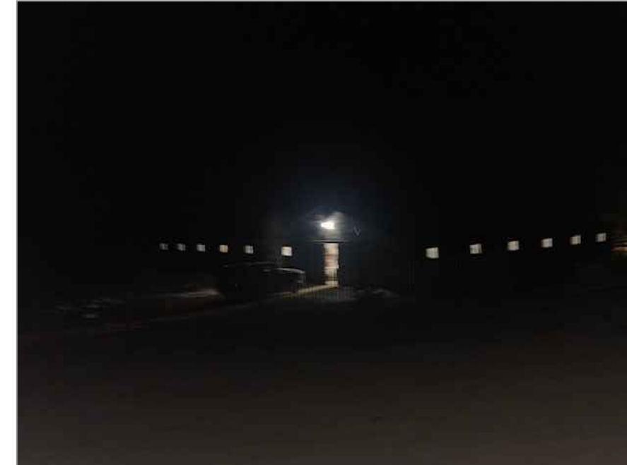
Wall Mounted Lighting, Night Exhibit