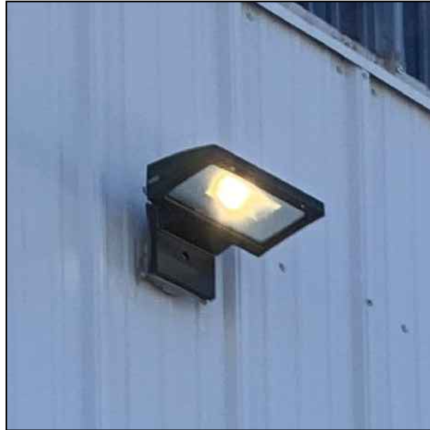
Wall Mounted Lighting