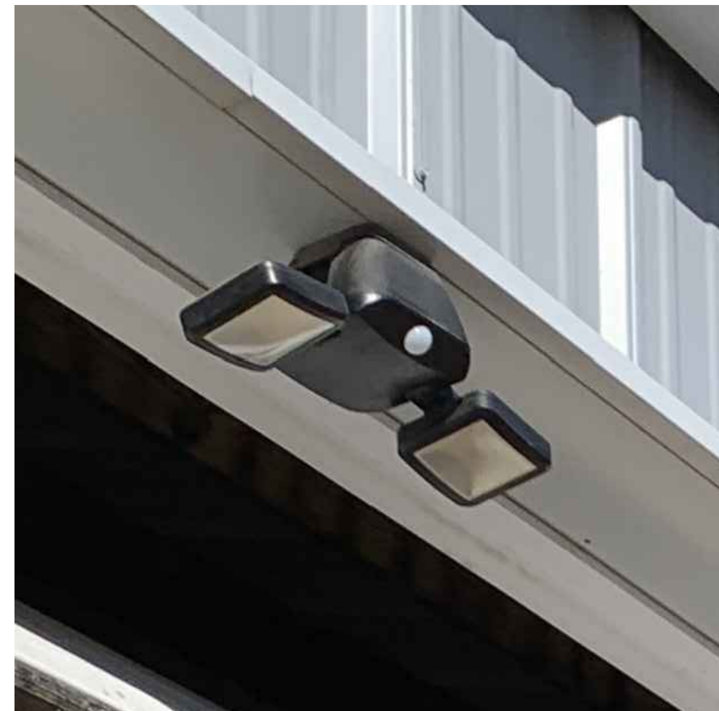
Wall Mounted Lighting