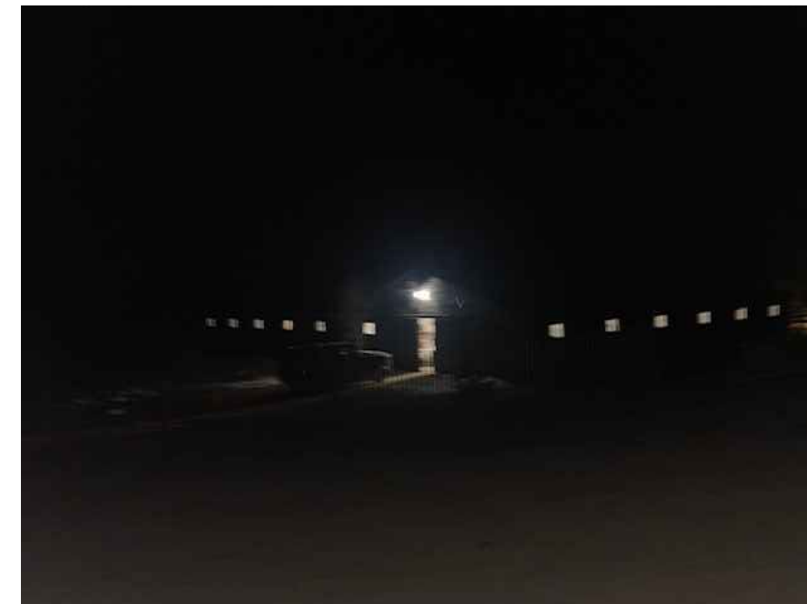
Wall Mounted Lighting, Night Exhibit