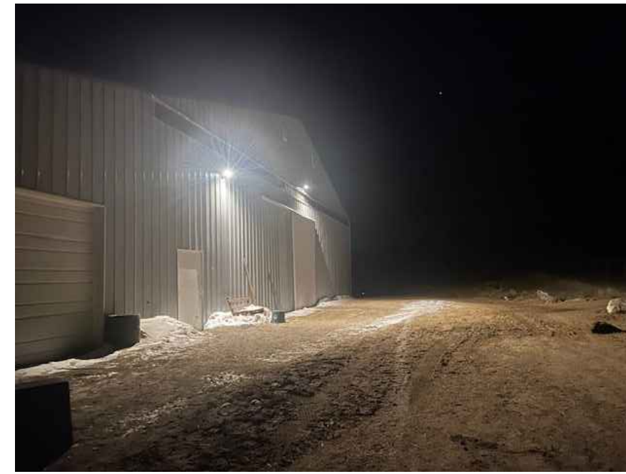
Wall Mounted Lighting, Night Exhibit

A PORTION OF THE SOUTHWEST QUARTER OF SECTION 15, TOWNSHIP 11 SOUTH, RANGE 65 WEST OF THE 6TH P.M., EL PASO COUNTY, COLORADO EL PASO COUNTY, COLORADO