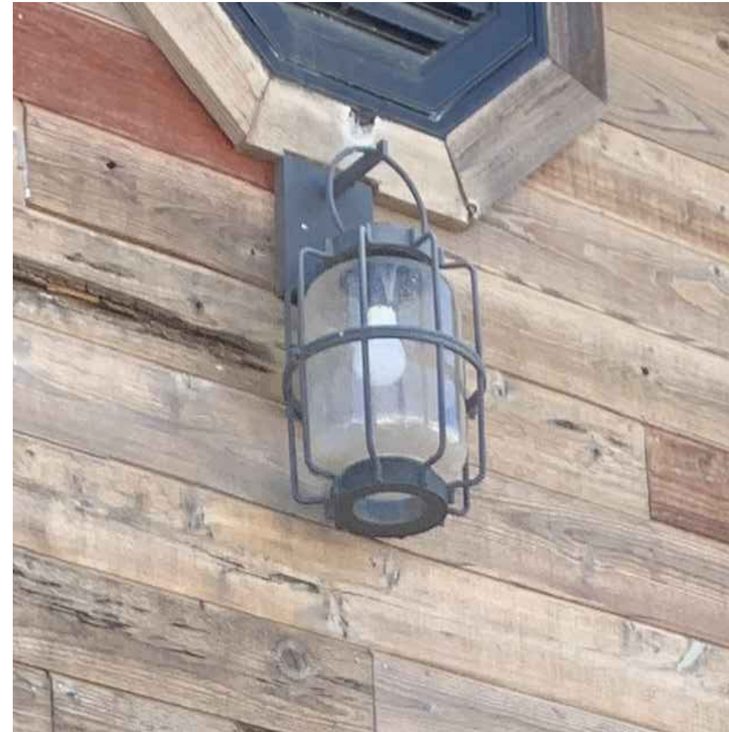
Wall Mounted Lighting