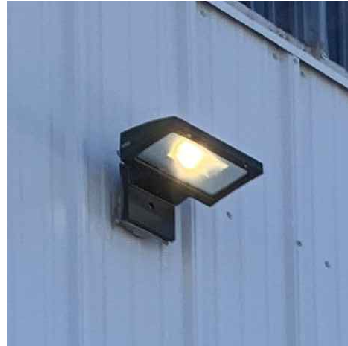
Wall Mounted Lighting

Property address: 9210 Morgan Road Property tax schedule number: Colorado Springs CO, 80908 Total Area: 51.5000007 Existing Land use: 51.62 Acres Proposed land use: Single Family Residential/Riding Academy and Stables Current Zoning: Riding Academy RR-5