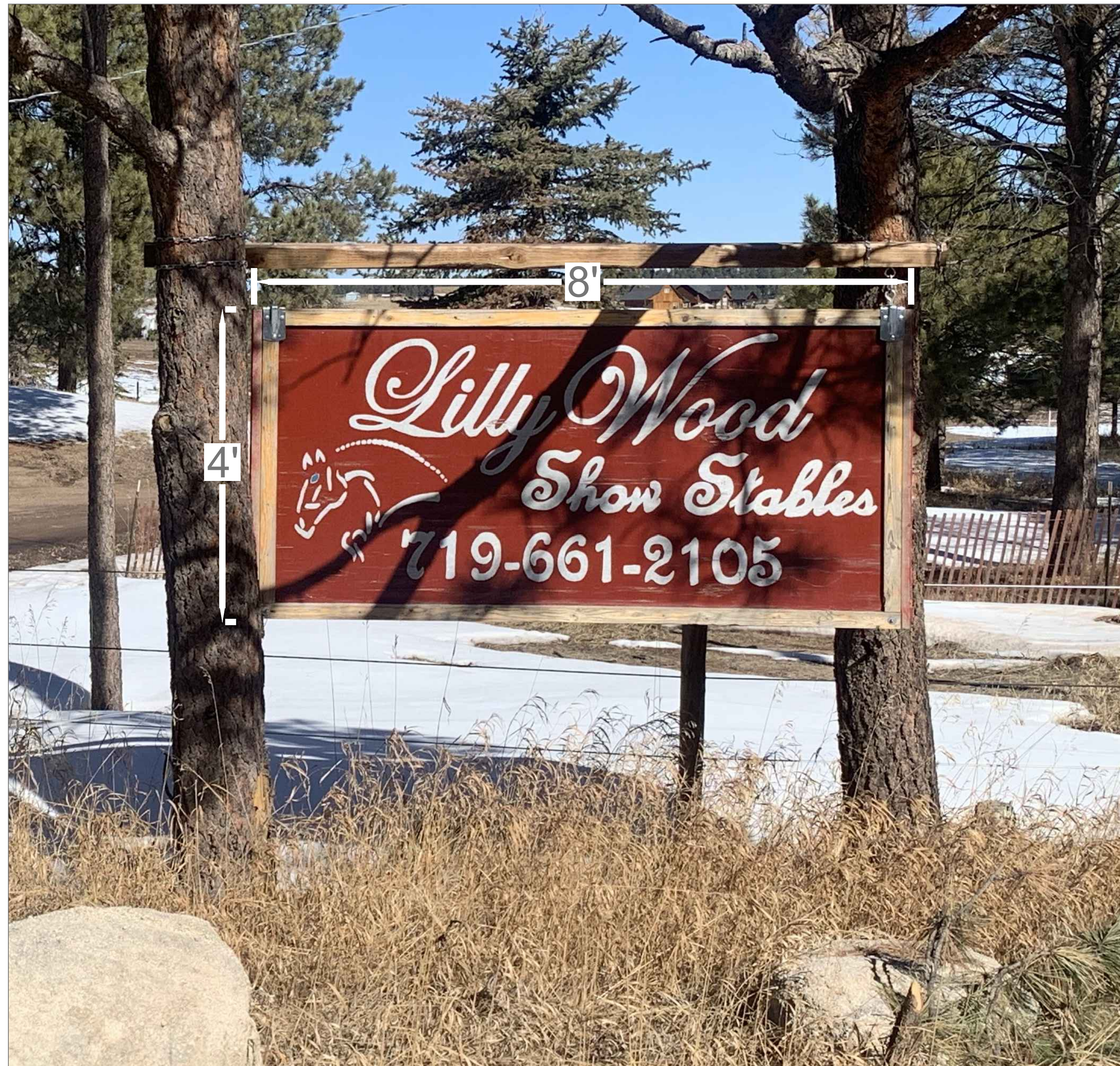
Note: Sign is not illuminated.

Please include: -setback distance to property lines -zoning -parcel number -sign elevation and detail -summary of sq footage allowed vs what is at the property -sight triangles near sign (if applicable)