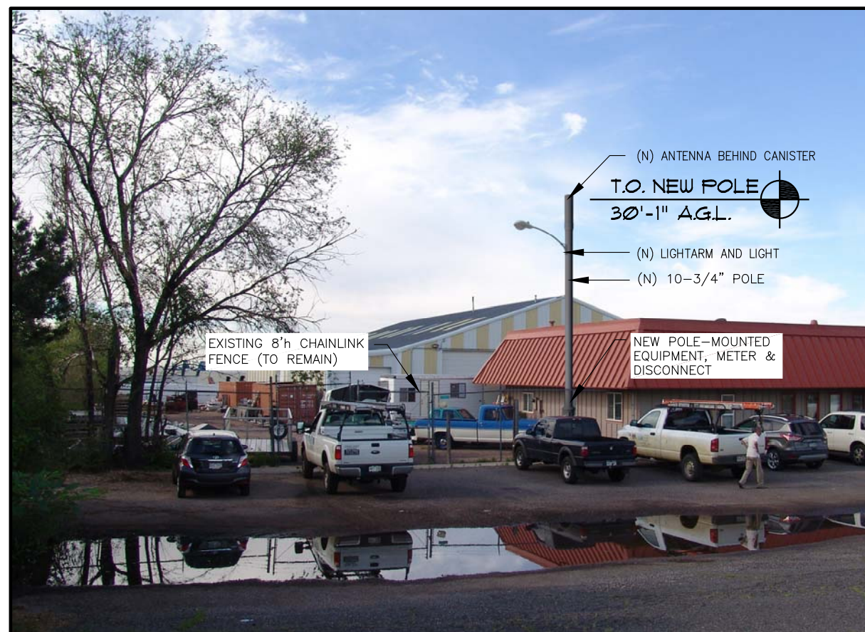
SIMULATED SITE ELEVATION 2 A-3 N.T.S.

NOTE: ALL EXPOSED STEEL, EQUIPMENT, SHROUDS, MOUNTING BRACKETS, AND MISC. PARTS SHALL BE PAINTED GALVANIZED GRAY TO MATCH NEARBY EXISTING LIGHTPOLES