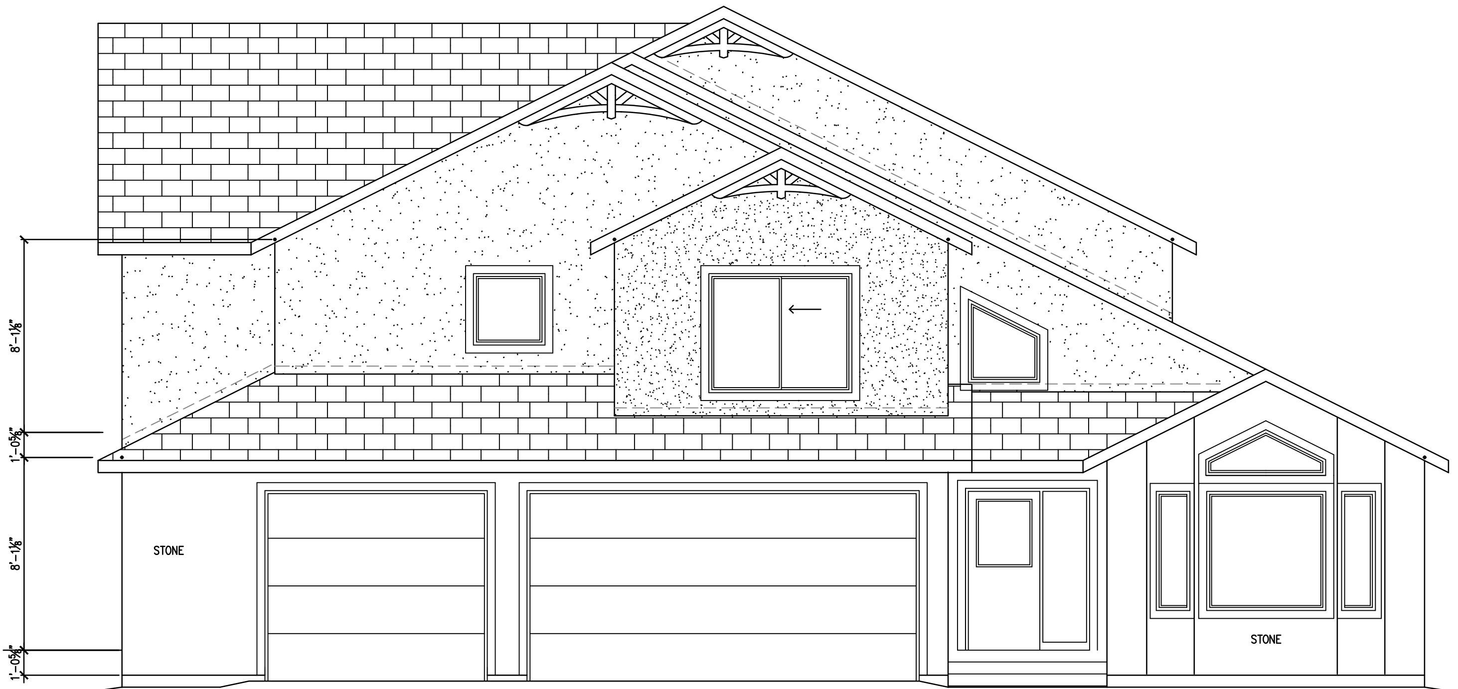
FRONT ELEVATION SCALE: 1/4"=1'-0"