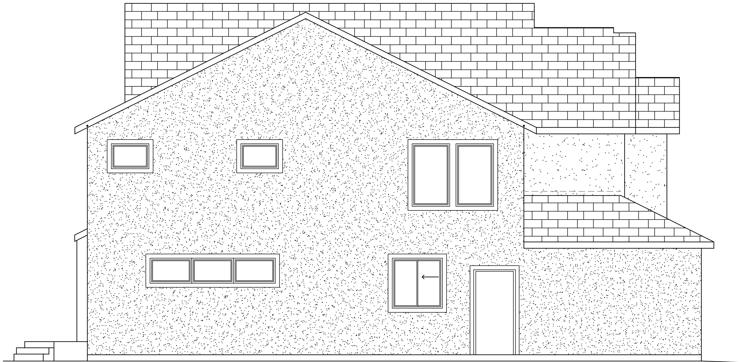
RIGHT ELEVATION SCALE: 1/4"=1'-0"