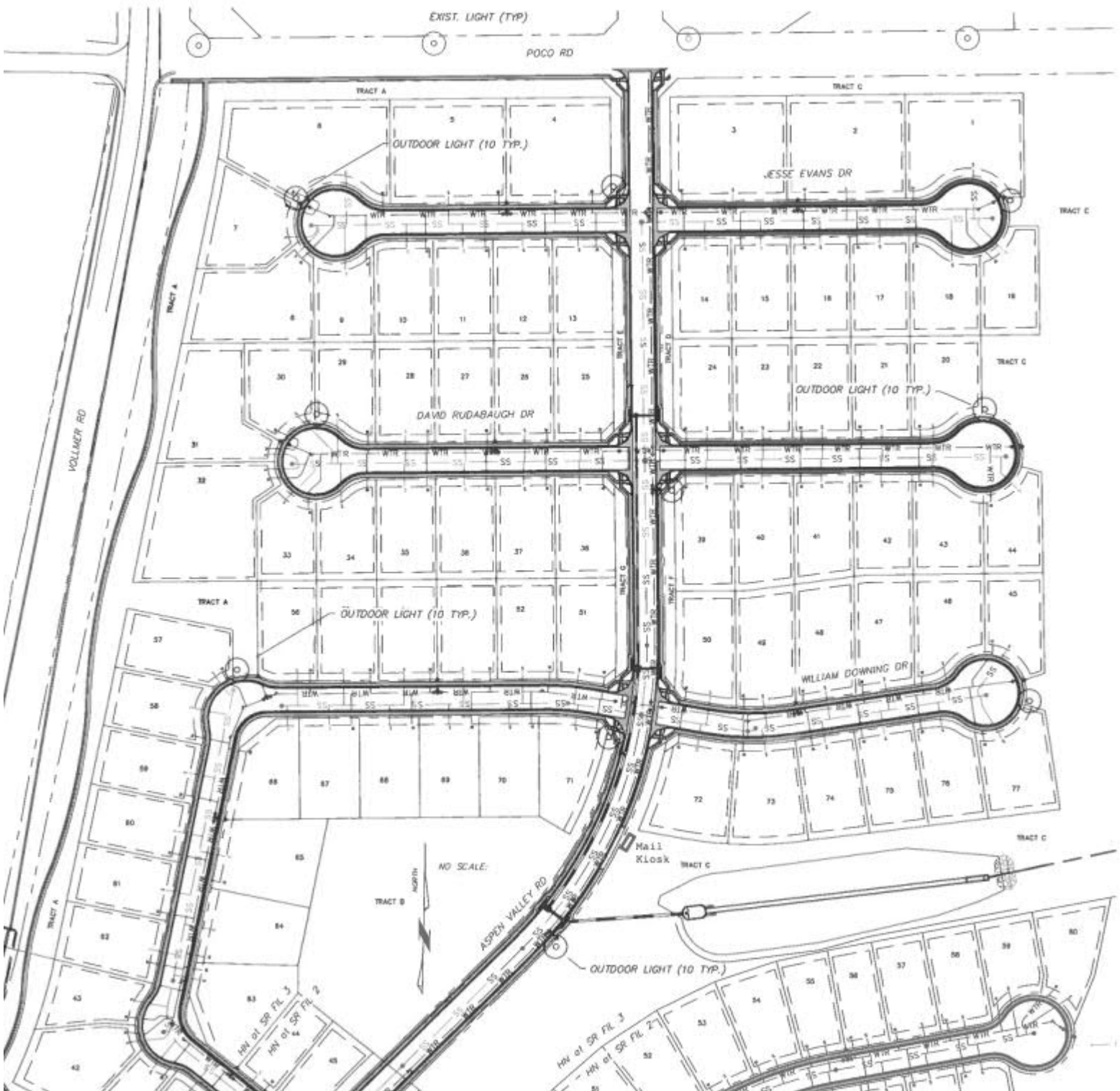
Exhibit A the "Licensed Premises"