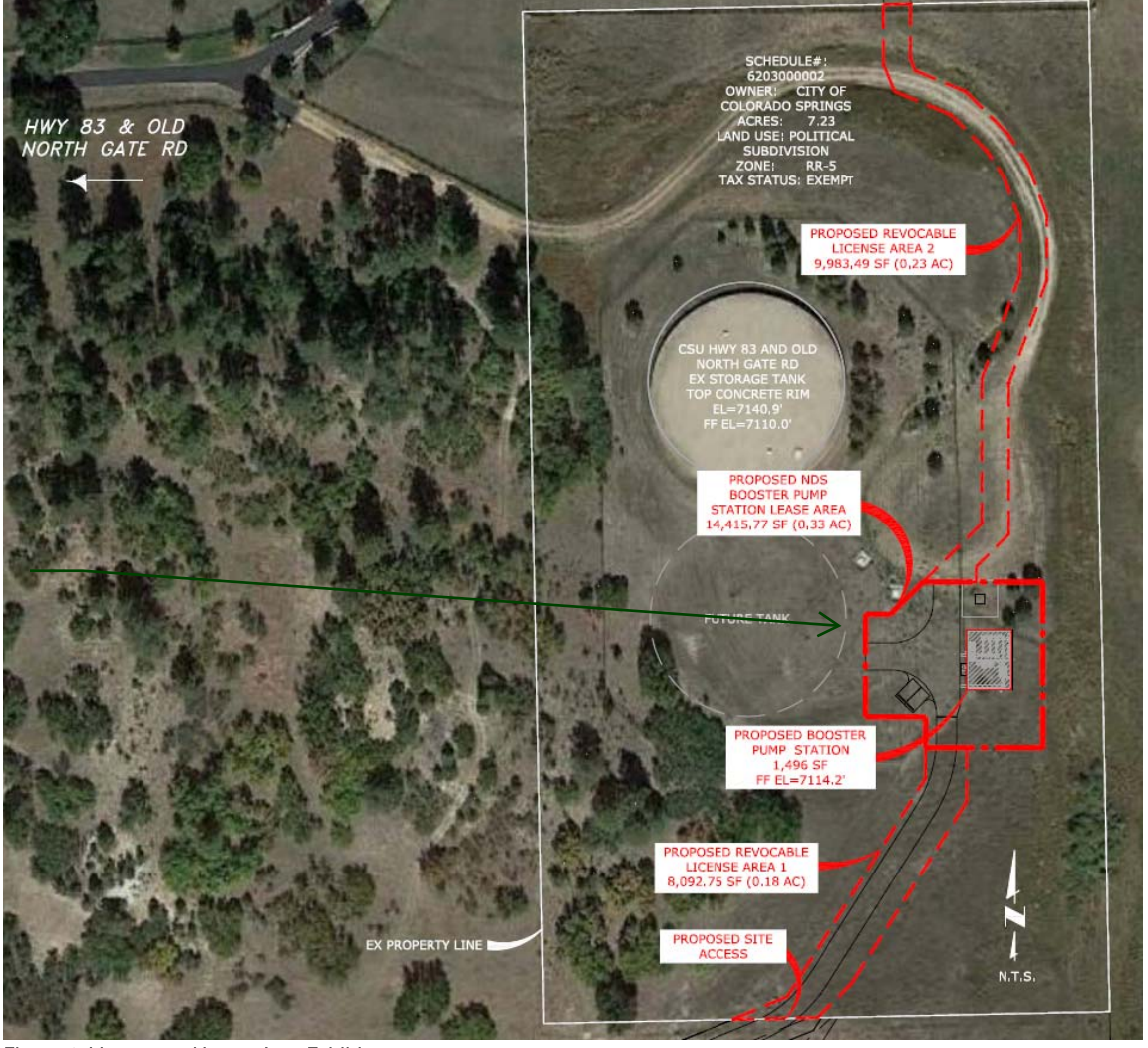
Figure 1. License and Lease Area Exhibit

The proposed license and lease area will contain the booster pump station and associated appurtenances. The existing parcel is bounded by: