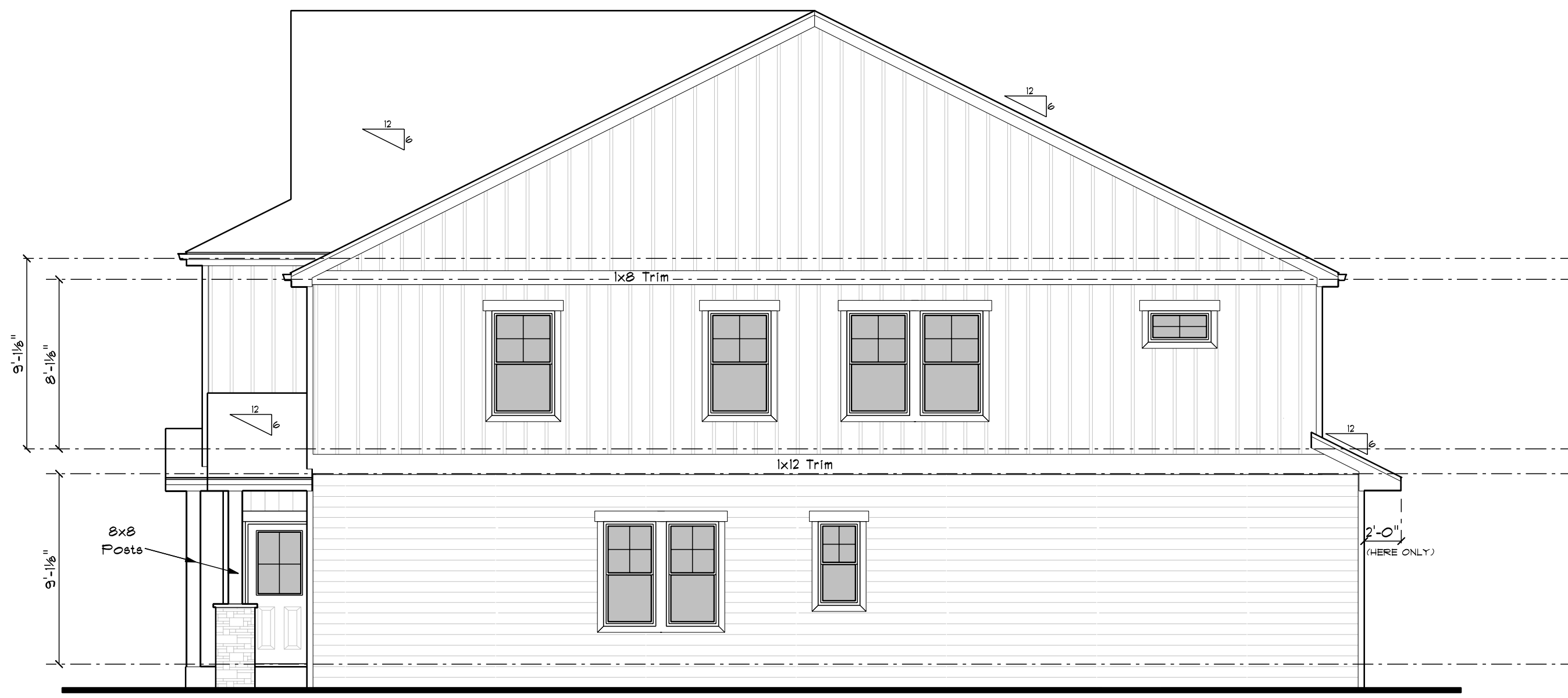
RIGHT ELEVATION Scale 3/16"=1'-0"

As feasible, all flue/exhaust pipes to be located on 'Back-side' of roof and shall be painted to match the roofing color.