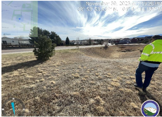
Photo 3: Drainage swale into existing detention is not installed to meet the top of slope of the detention pond.