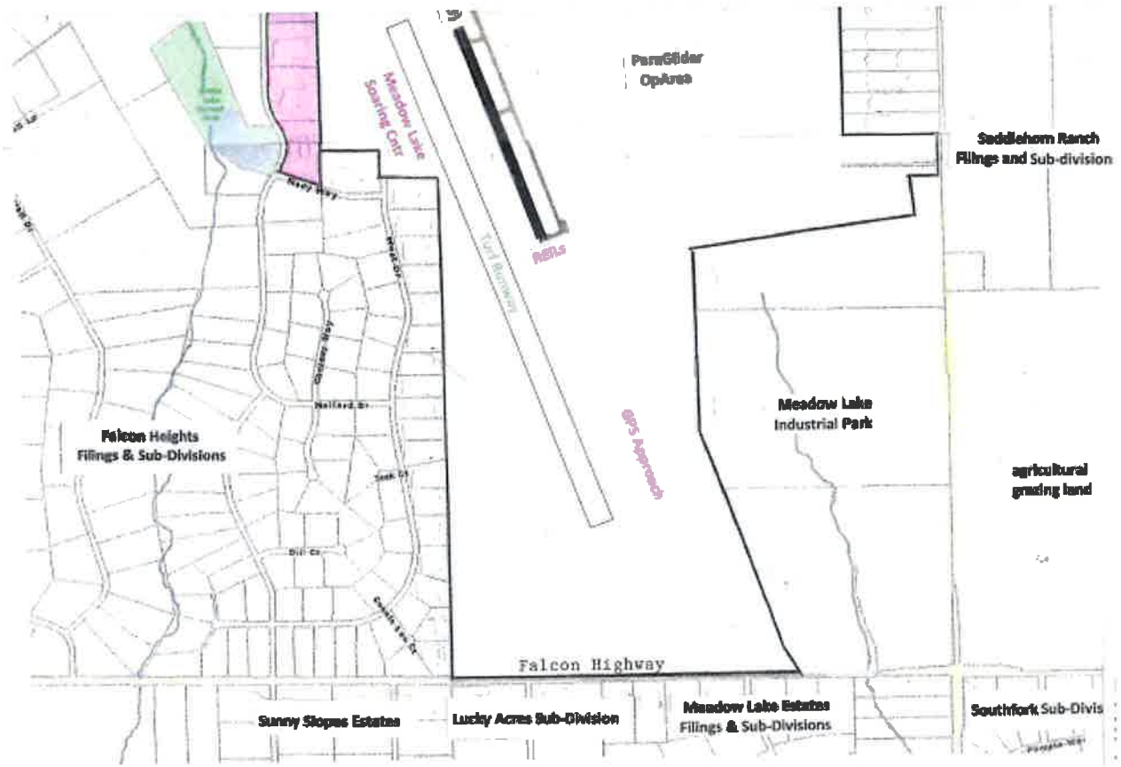
South Area Portion of 1041