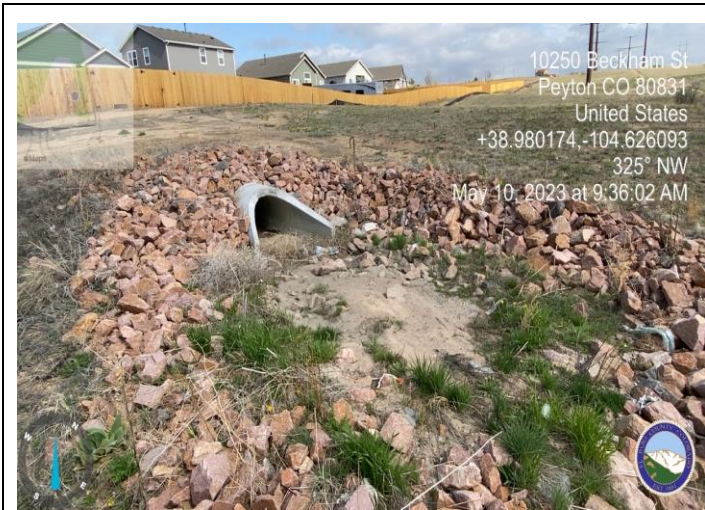
Photo 3: Maintenance low tail water basin, reestablish riprap pad.