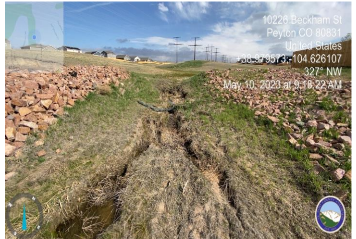
Photo 6: Remove rock sock from swale north of northern forebay. Monitor erosion above forebay.