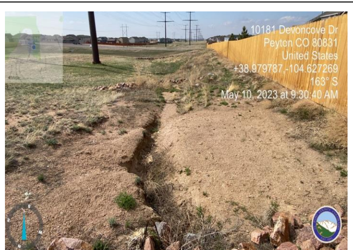
Photo 4: Tract A western perimeter, erosion occurring. Backfill and regrade.