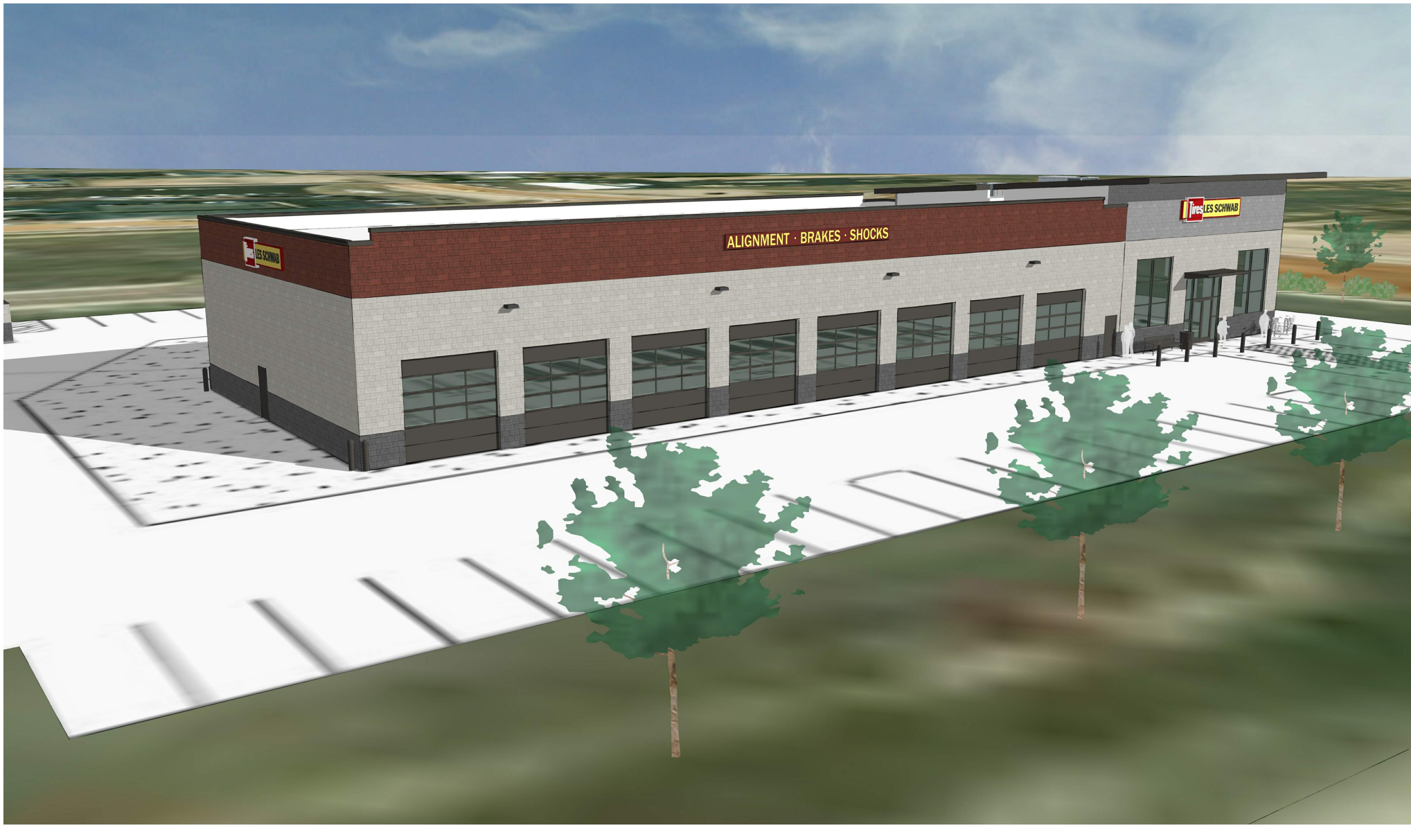
2 A2.0 N.T.S. FRONT PERSPECTIVE @ SERVICE BAYS