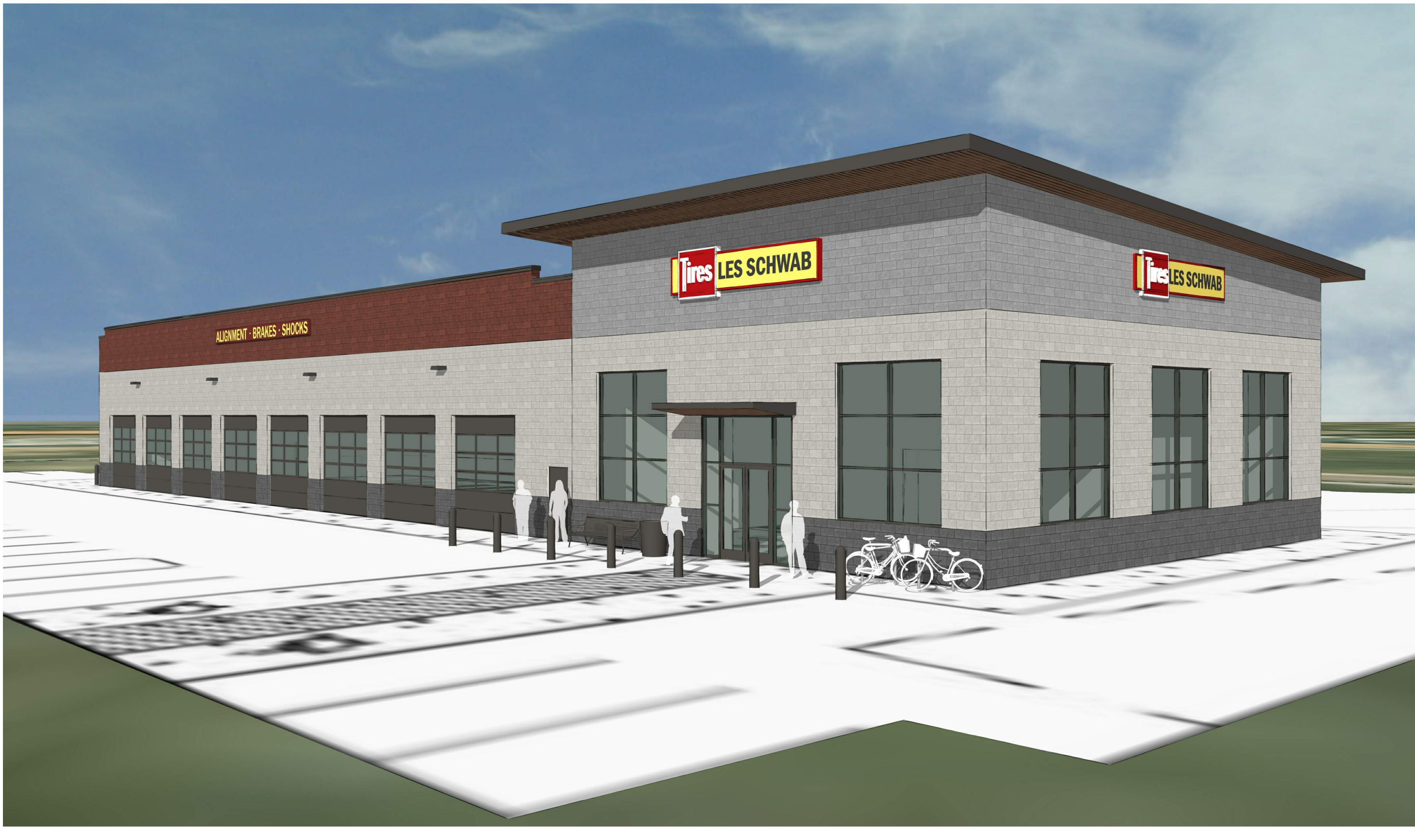
1 A2.0 N.T.S. FRONT PERSPECTIVE