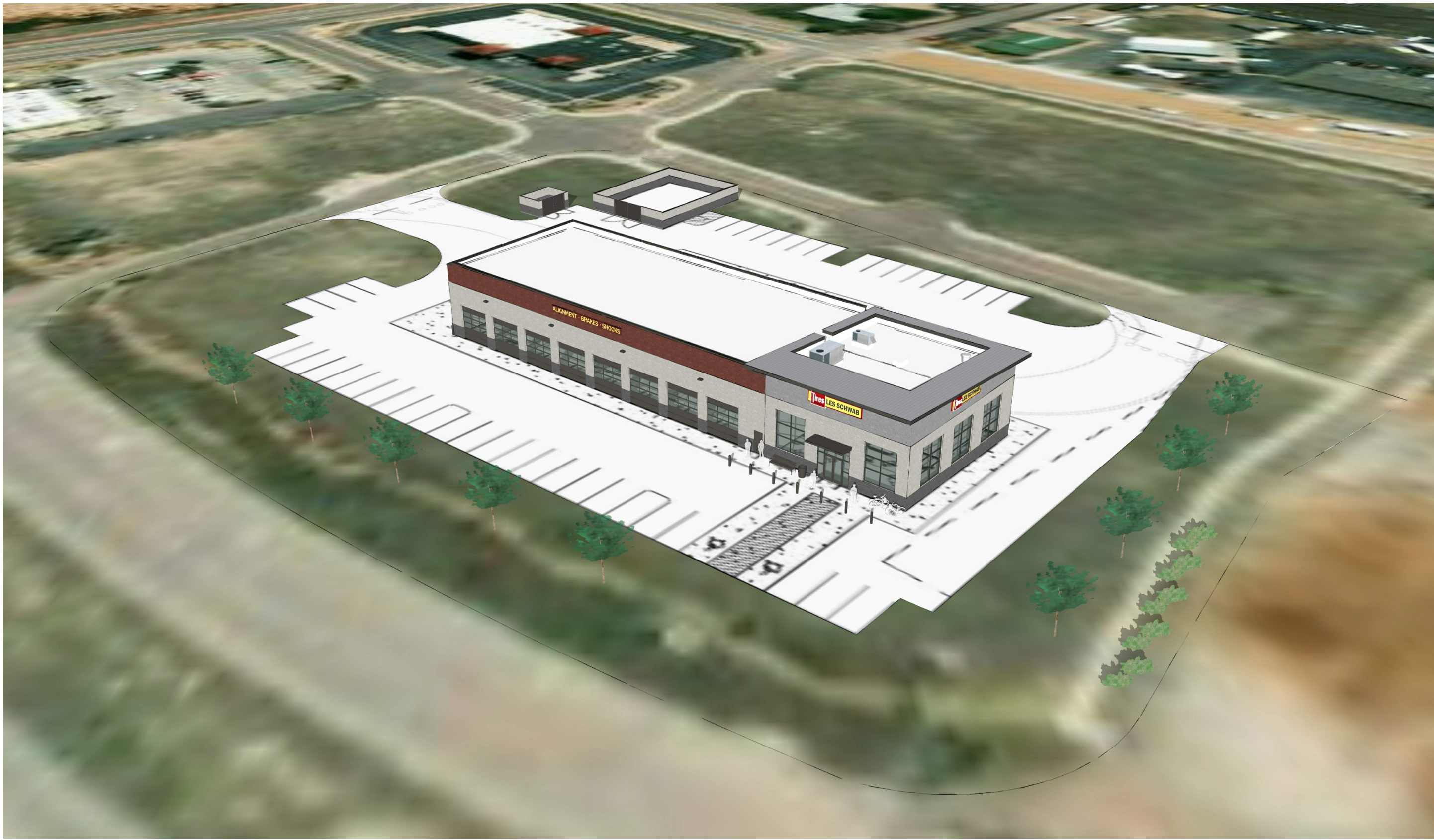
3 A2.0 N.T.S. SITE AERIAL VIEW

7105 OLD MERIDIAN RD. FALCON, CO LES SCHWAB TIRE CENTER