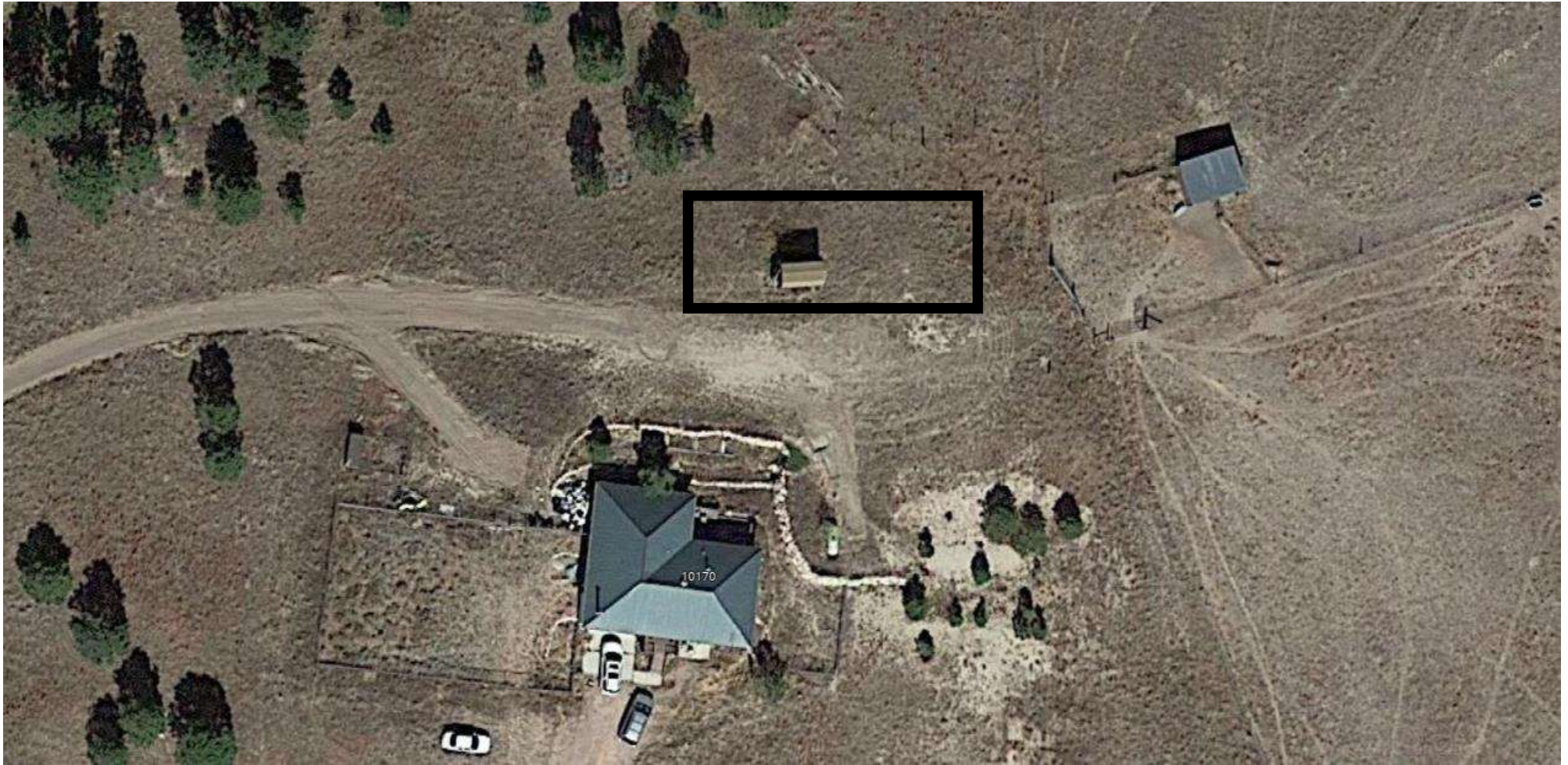
60 x 30 x 14 tubular steel building to replace existing dilapidated mobile tool shed to north of house. Gates to pasture and loafing shed directly to the east.