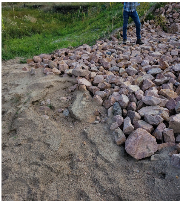
Photo 9/16/2022 – taken by USACE (Zdimal); standing within aquatic resource W2; looking southwest and upslope towards constructed stormwater detention basin. Bristlecone Ecology staff is shown standing on rip rap below the outfall near the boundary of aquatic resource W2, indicating a portion of the riprap was been placed in W2, and fill/sediment has been placed/ deposited below the riprap.