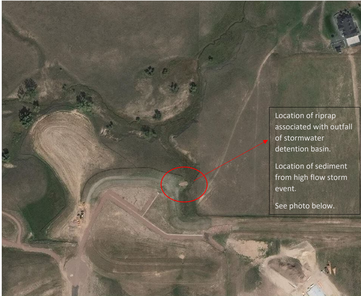
aerial 9/7/2022