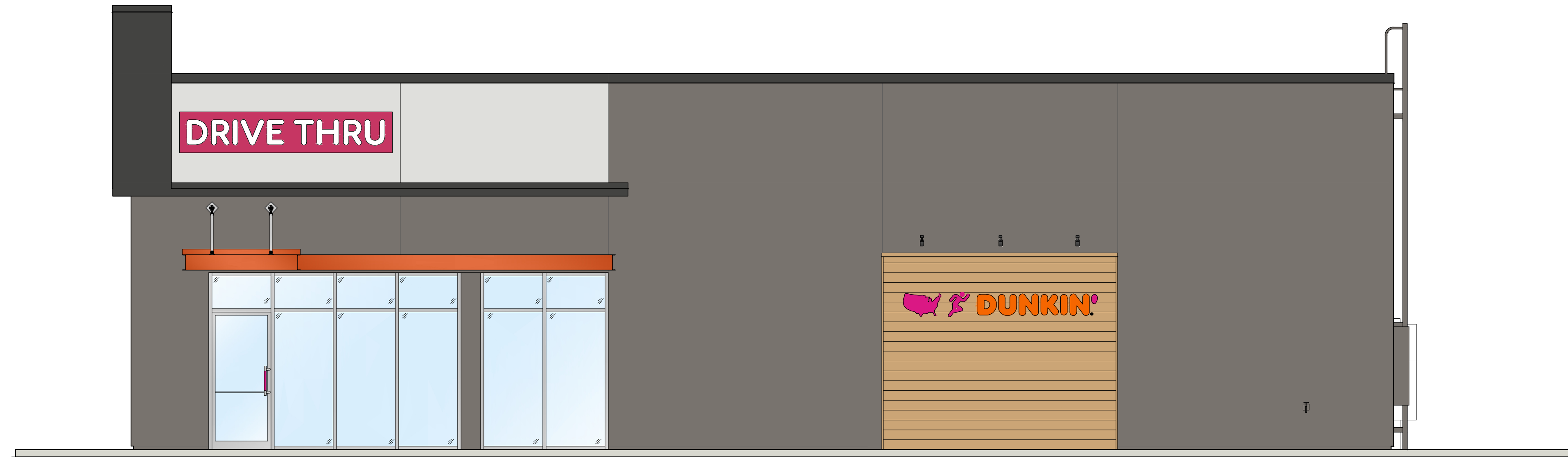
○ NORTH ELEVATION