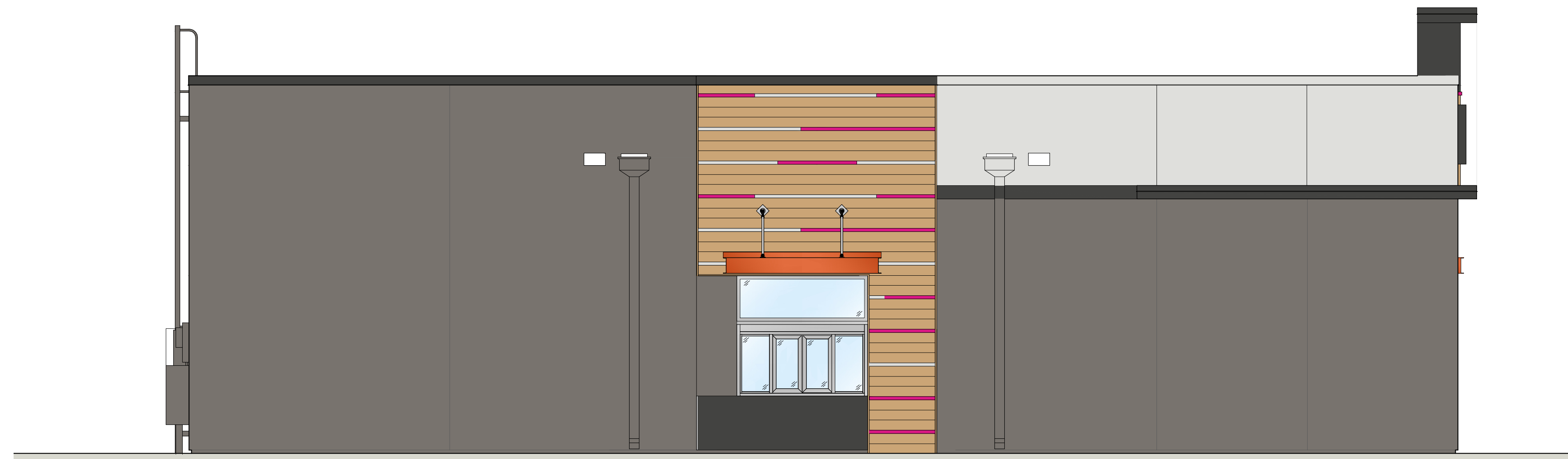
○ SOUTH (DRIVE-THRU) ELEVATION