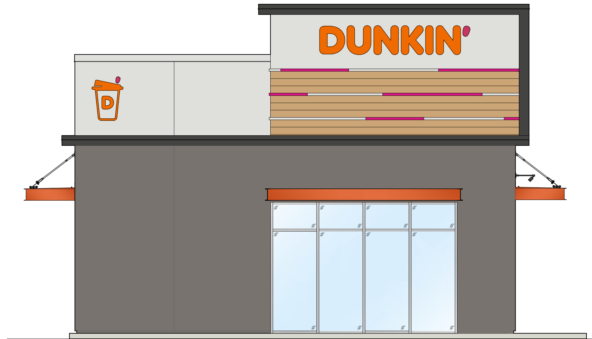
○ EAST (MARKSHEFFEL ROAD) ELEVATION