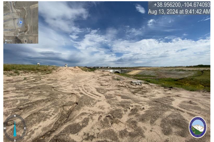
Photo 2: Swale to area drains in Tract C not installed per plan detail. Install per approved plans. Reference Sheet 2 of 7 of GEC Plan.

Photo 1: Swale behind lots 6-8 not installed per plan detail. Install per approved plans or confirm with your project engineer that this change from the plans is acceptable and then reflect the change on the as-builts. Reference Sheet 2 of 7 of GEC Plan.