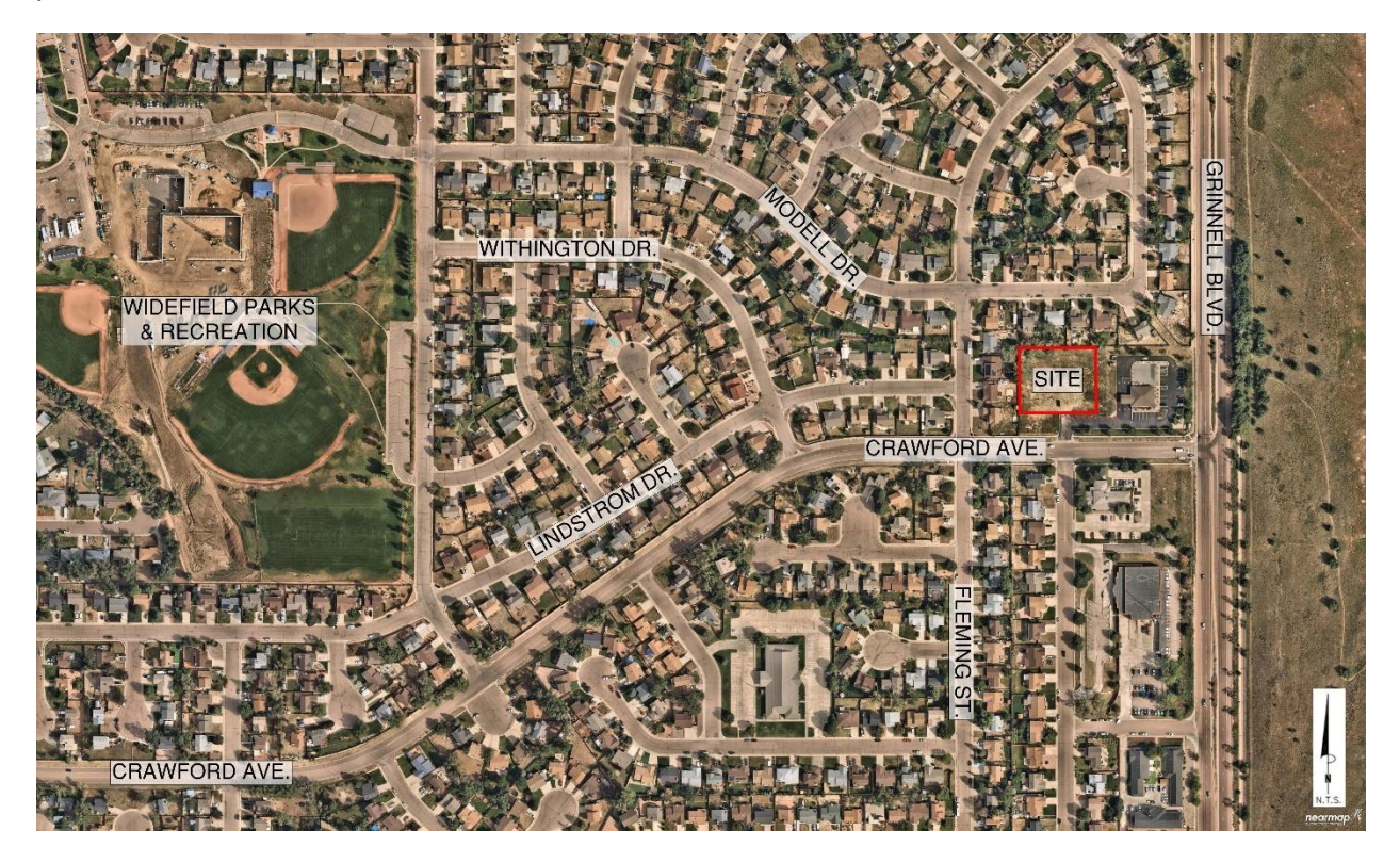
Description of Property

The Site is located at the northwest corner of Crawford Ave and Grinnell Blvd. and currently consists of Tract A of the Fountain Valley Ranch Filing No. 6B (the "Site"). More specifically, the Site is situated in the northeast quarter of Section 13, Township 15 South, Range 66 West of the Sixth Principal Meridian, City of Fountain, County of El Paso, State of Colorado. The Site is bounded by Crawford Ave to the south, an existing commercial lot to the east, and existing residential lots to the north and west. A vicinity map is provided below for reference: