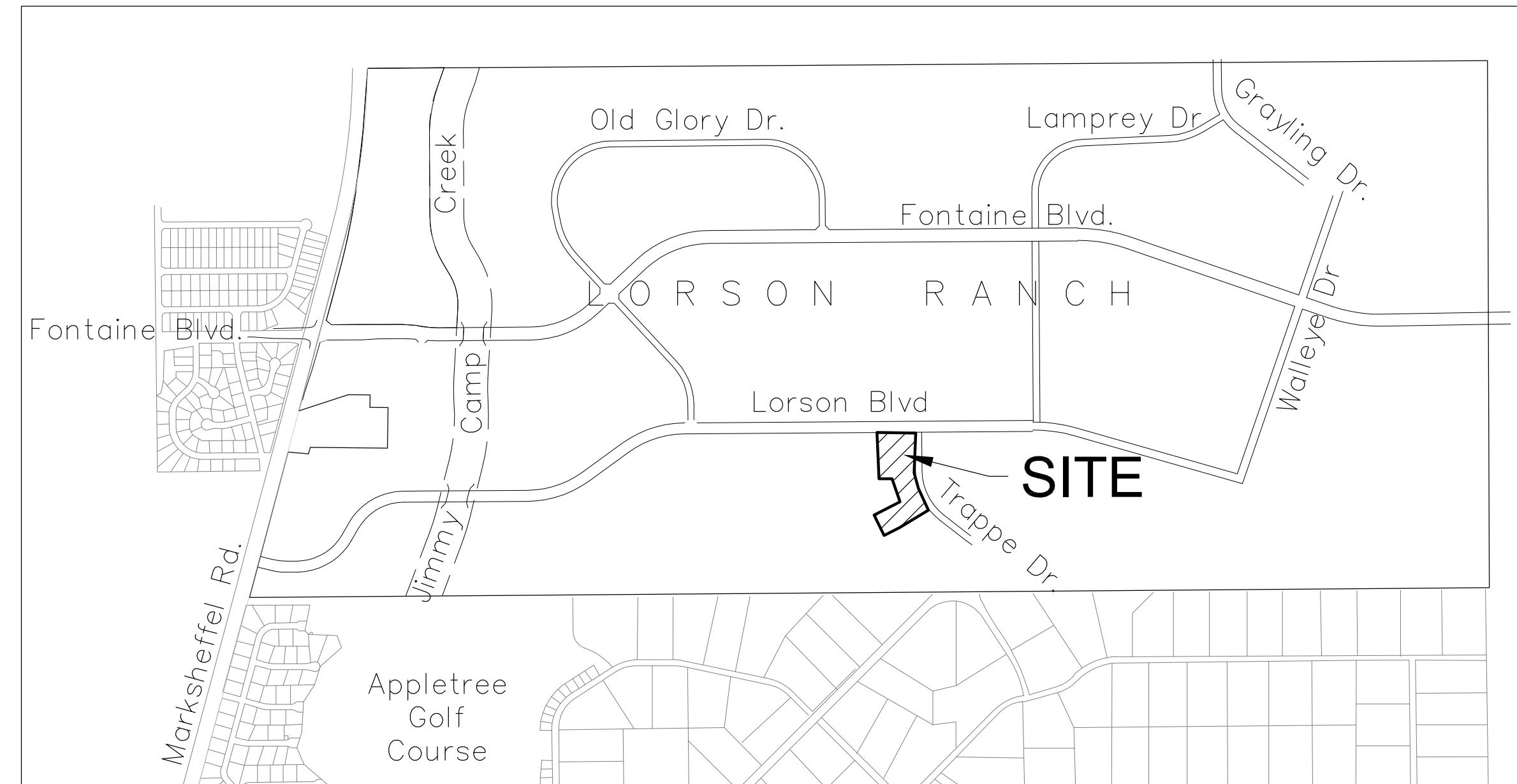
VICINITY MAP NO SCALE