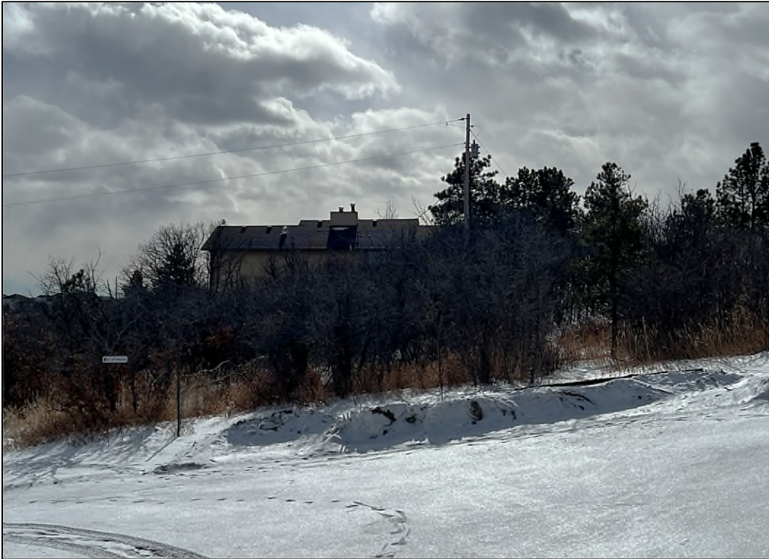
View: Looking south from Site No. 11 toward property line and adjacent residence (located beyond vegetation)