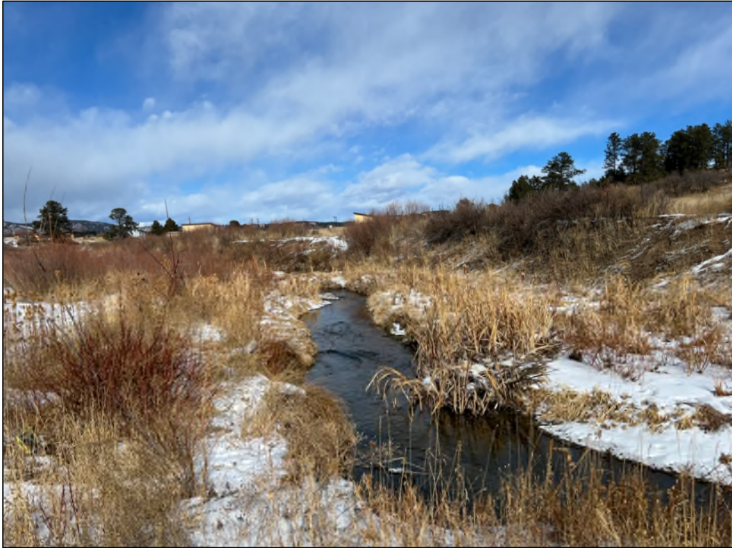
View: Looking north along Monument Creek showing grade change and vegetated buffer