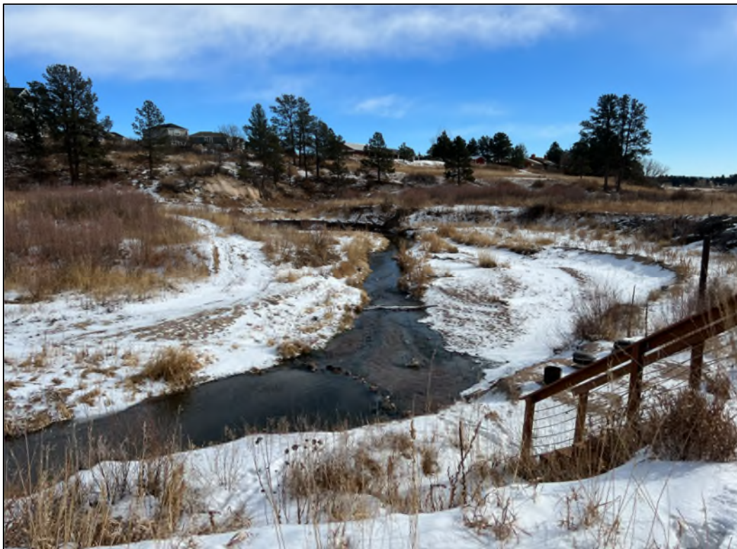
View: Looking southeast along Monument Creek towards the Town of Monument development