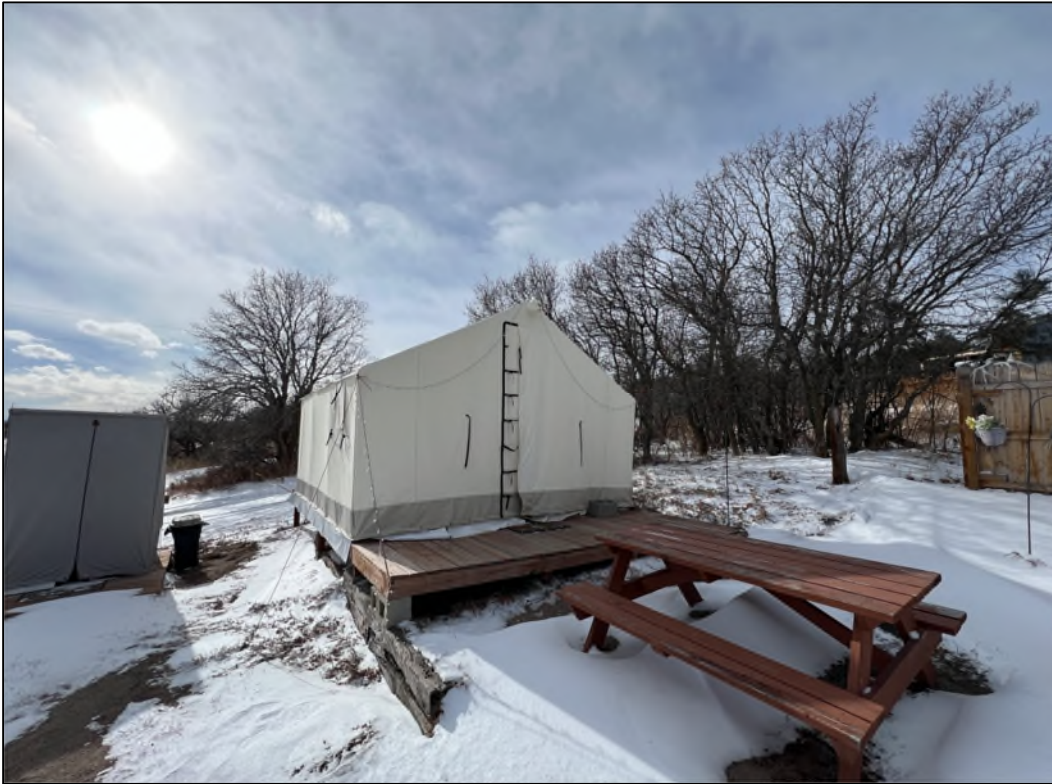
View: Looking south towards Site No. 7 (with existing opaque fencing) and the southern property line (located beyond vegetation)