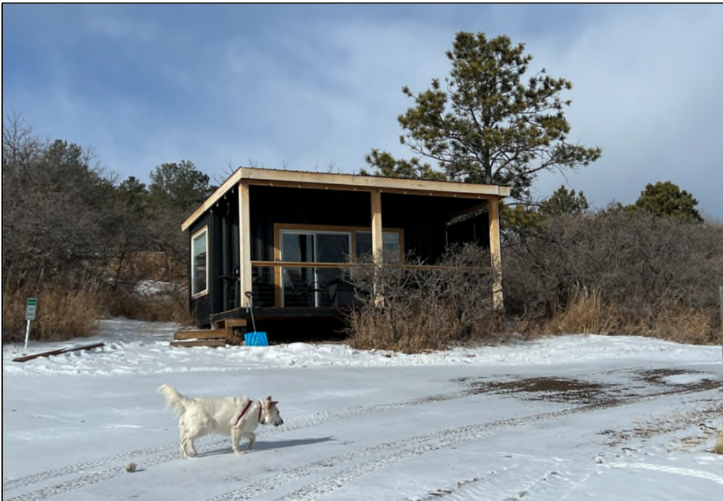
View: Looking west towards Site No. 11 and Rickenbacker Avenue (located beyond vegetation)