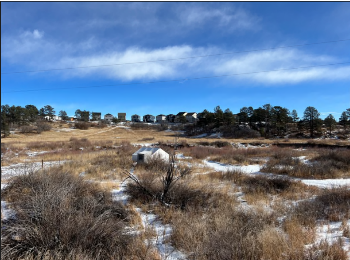
View: Looking east towards Site No. 8, Monument Creek, and Town of Monument development