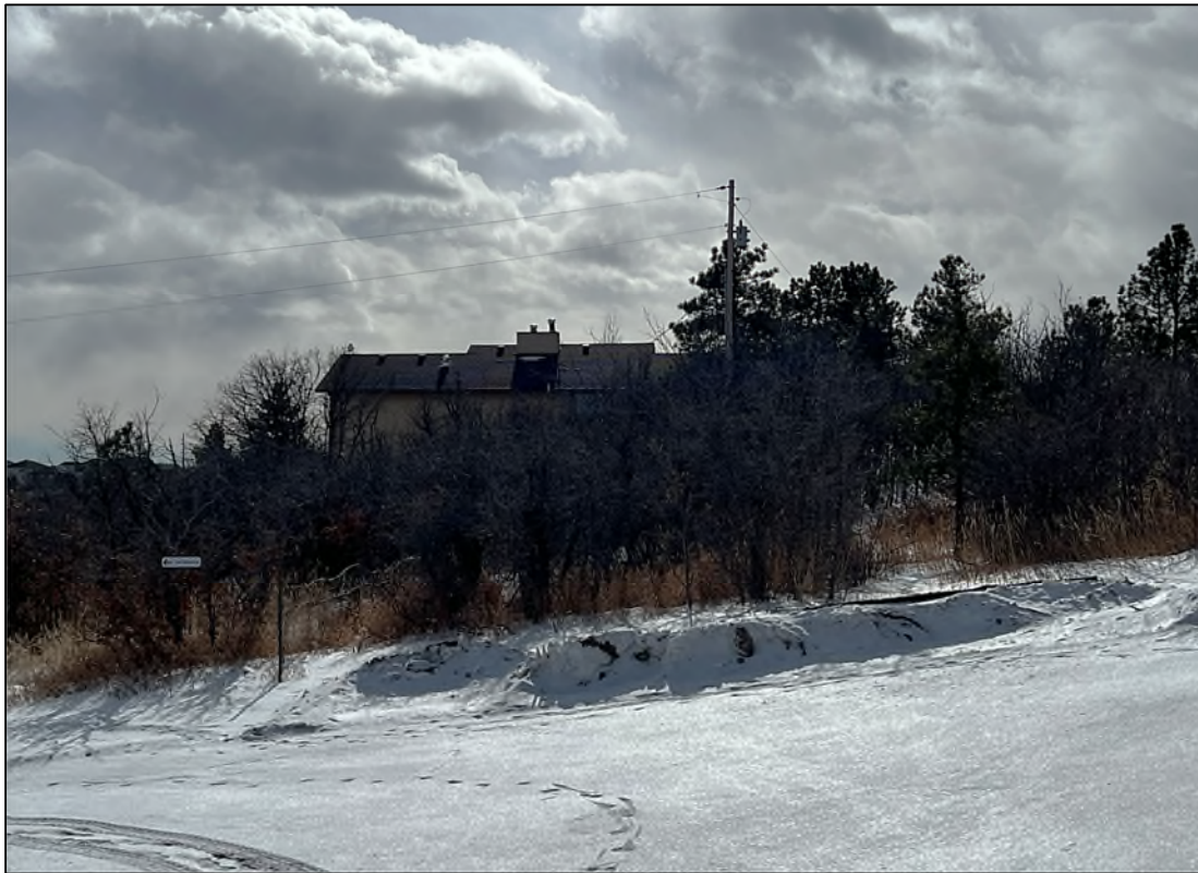
View: Looking south from Site No. 11 toward property line and adjacent residence (located beyond vegetation)