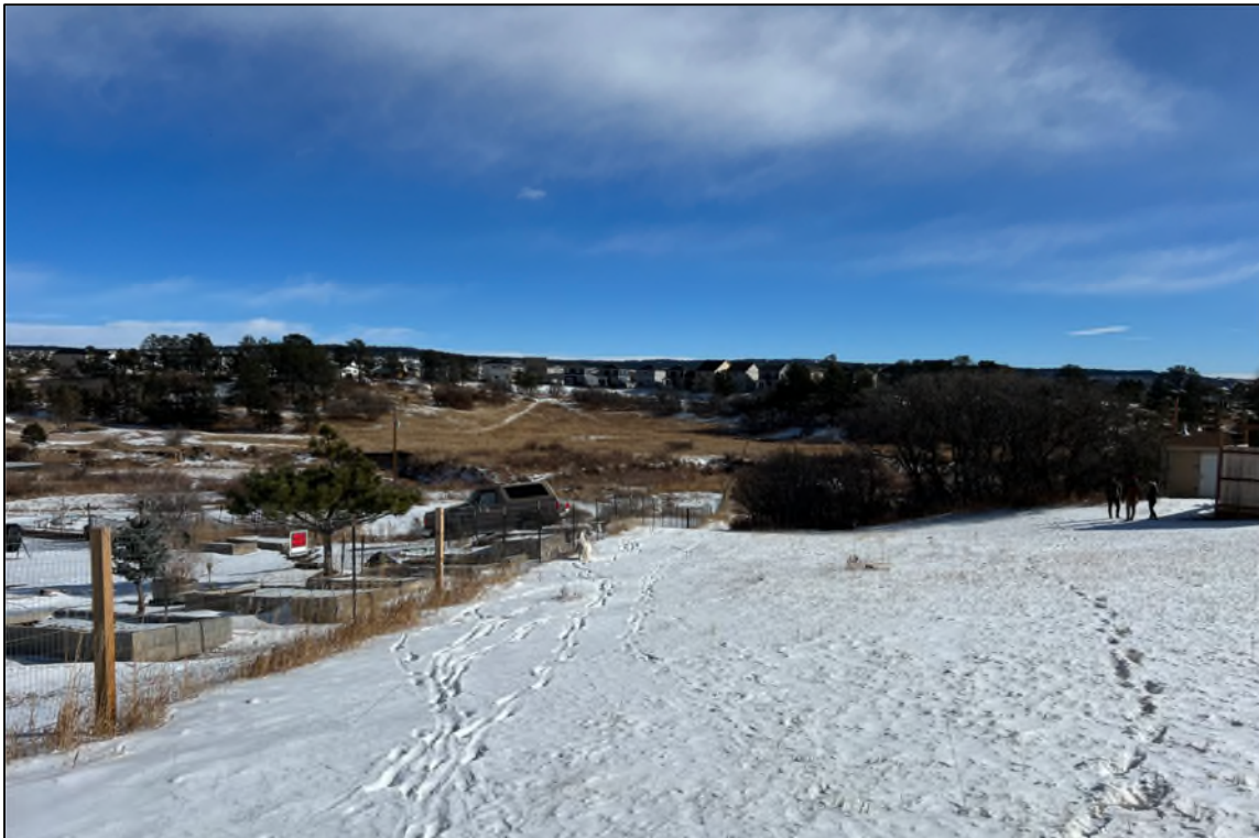
View: Looking west to east along the northern property line (fence)

Below are photos taken from internal locations on the property showing the substantial existing vegetation, slope, and site setbacks from the respective property lines: