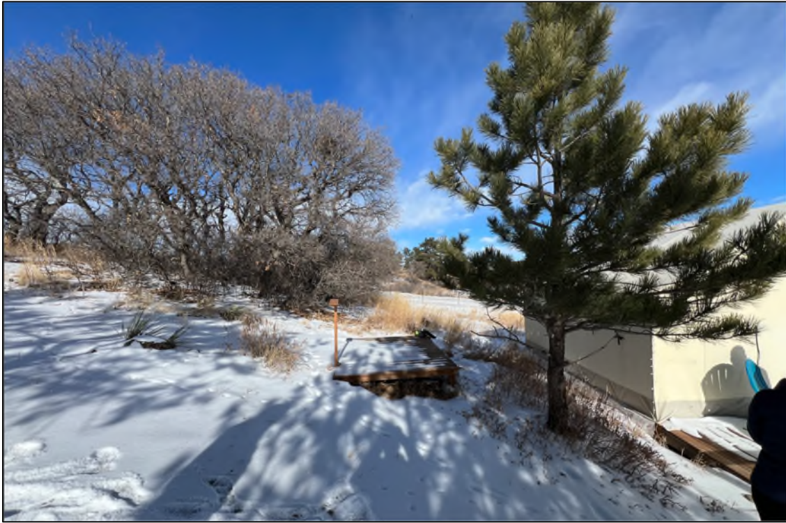
View: Looking north from Site No. 5 towards northern property line (fence)