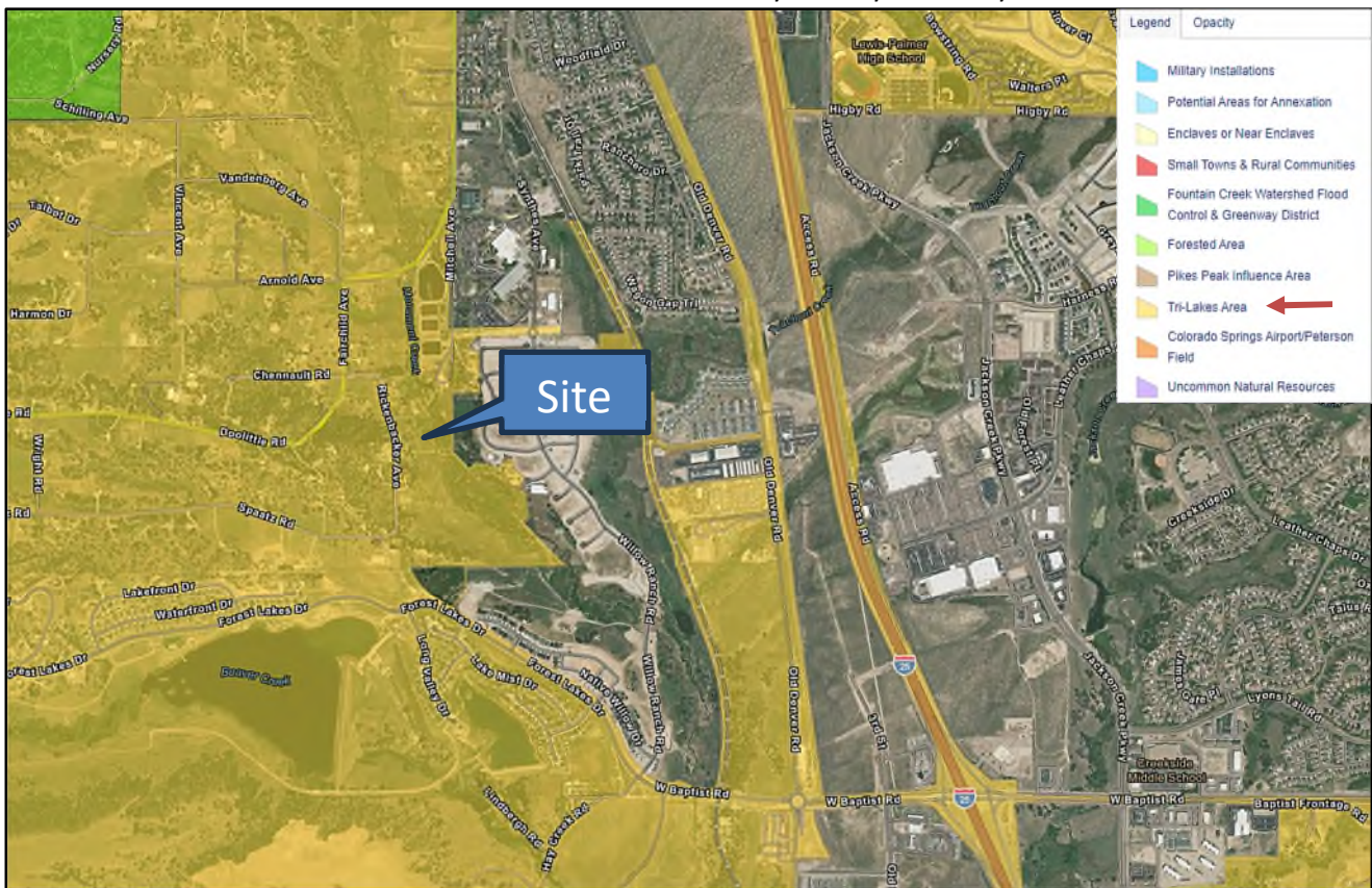
Master Plan Exhibit: El Paso County GIS Key Areas Layer

The Key Area recommends that additional entertainment opportunities be allowed within the key area. The proposed recreation camp use is consistent with the Master Plan as a compatible commercial use that supports the local tourism industry while providing low-intensity, nature-based entertainment. The Recreation Camp land use was already determined to be consistent with the rural residential character of the RR-5 zoning district when it was designated as a special use in the Land Development Code . The significance of that designation cannot be understated since special uses are commonly considered to be those land uses that the County has already determined to be compatible with the underlying zoning of the property but which may require additional County review due to potential impacts.