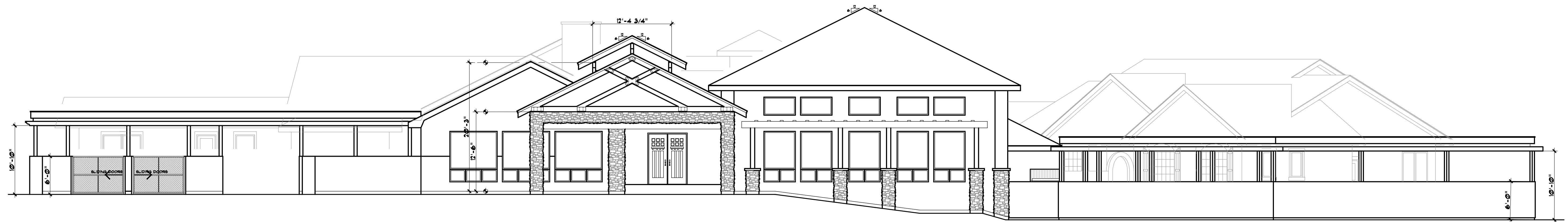
A Proposed Front Elevation A-9 SCALE: 1/8"=1'-0"