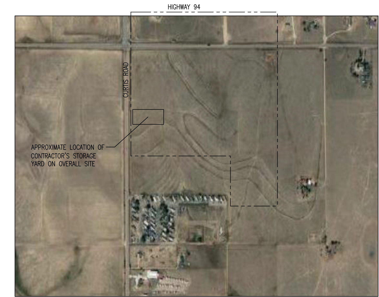
VICINITY MAP NO SCALE 500'-0"