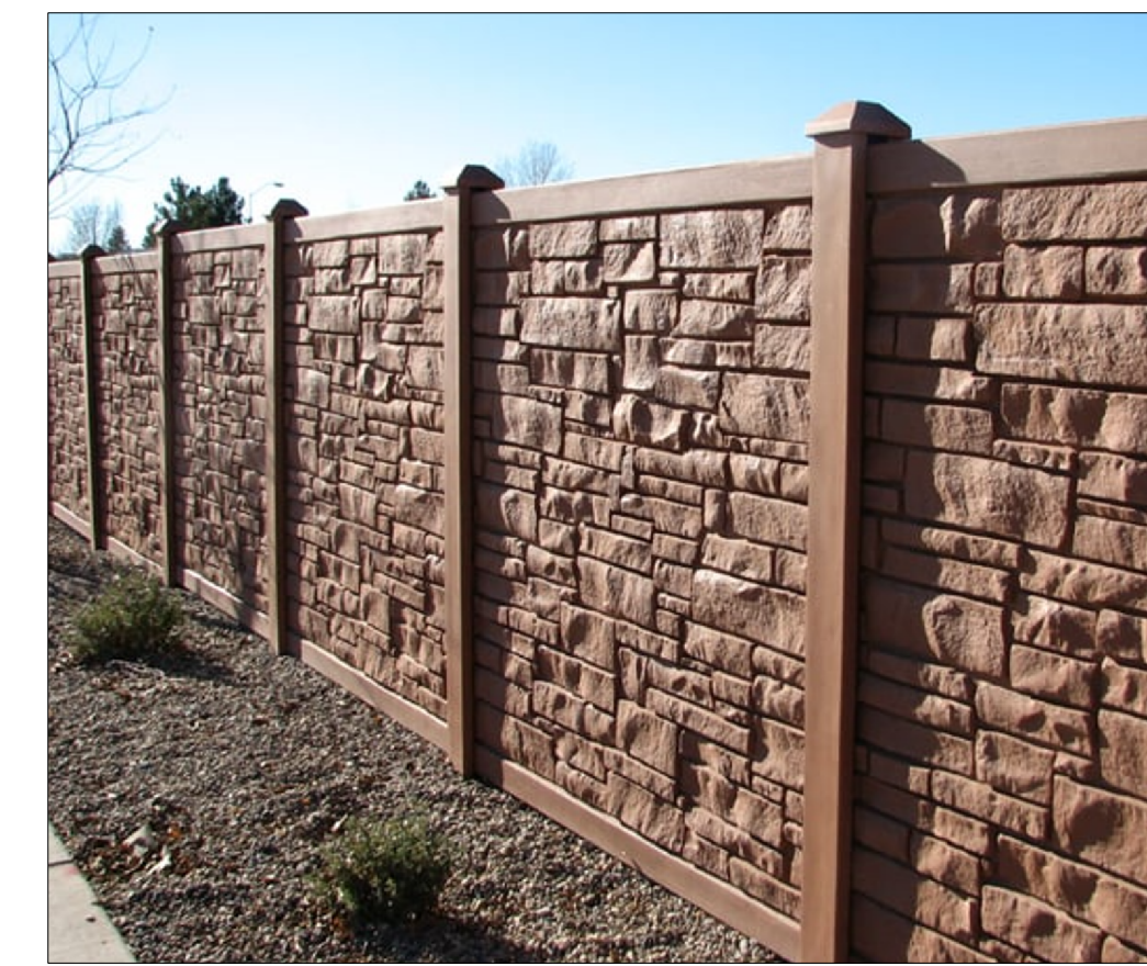
8' PANEL FENCE AND SCREENING SYSTEM