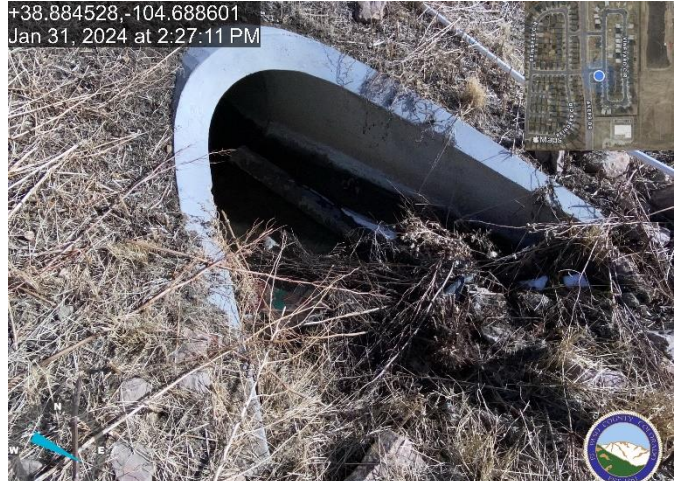
Photo 10: Remove sediment and debris from south pond flared end section.

+38.884528,-104.688601 Jan 31, 2024 at 2:27:11 PM