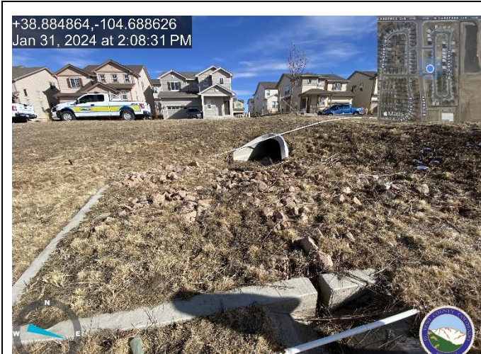
Photo 1: North pond forebay not installed per spec. (Page 24 Forebay cross section)