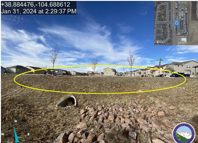
Photo 11: Reshape the overflow weir so that it is the lowest point along the pond embankments

+38.884476,-104.688612 Jan 31, 2024 at 2:29:37 PM