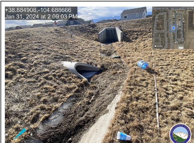
Photo 3: Trickle channel requires maintenance. Remove sediment and temporary control measures. (North Pond)