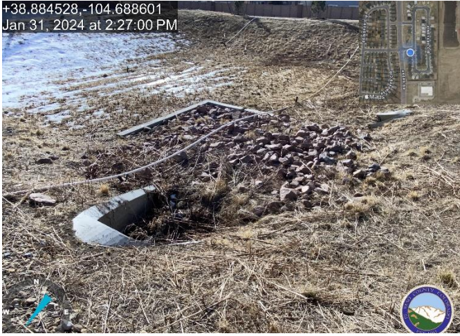
Photo 9: South pond forebay not installed per spec. (Page 25 Forebay cross section)

+38.884528,-104.688601 Jan 31, 2024 at 2:27:00 PM