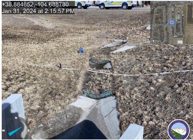
Photo 5: Trickle channel requires maintenance. Remove sediment and temporary control measures. (North Pond)