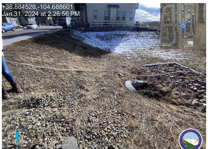
Photo 8: South pond maintenance road not installed per spec. ( 8' wide with 2" rock and extends to forebay)