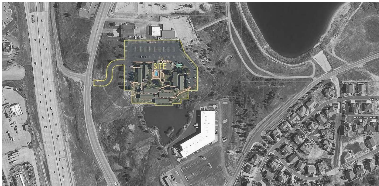
Figure 1. Vicinity Map

The site is located at 1865 Woodmoor Drive in Monument, Colorado (Figure 1). The site is located east of Woodmoor Drive and north of Lake Woodmoor Drive. To the north is the Tri-Lakes Monument Fire Protection District Station and the Woodmoor Water & Sanitation District Office. To the west is vacant land owned by Lake Woodmoor Holdings LLC. To the east is vacant open space owned by Lake Woodmoor Development Inc. Immediately to the south is a pond, beyond which is Woodmoor Center, a commercial development. The site is approximately 5.11 acres and is currently an operating Ramada by Wyndham hotel.