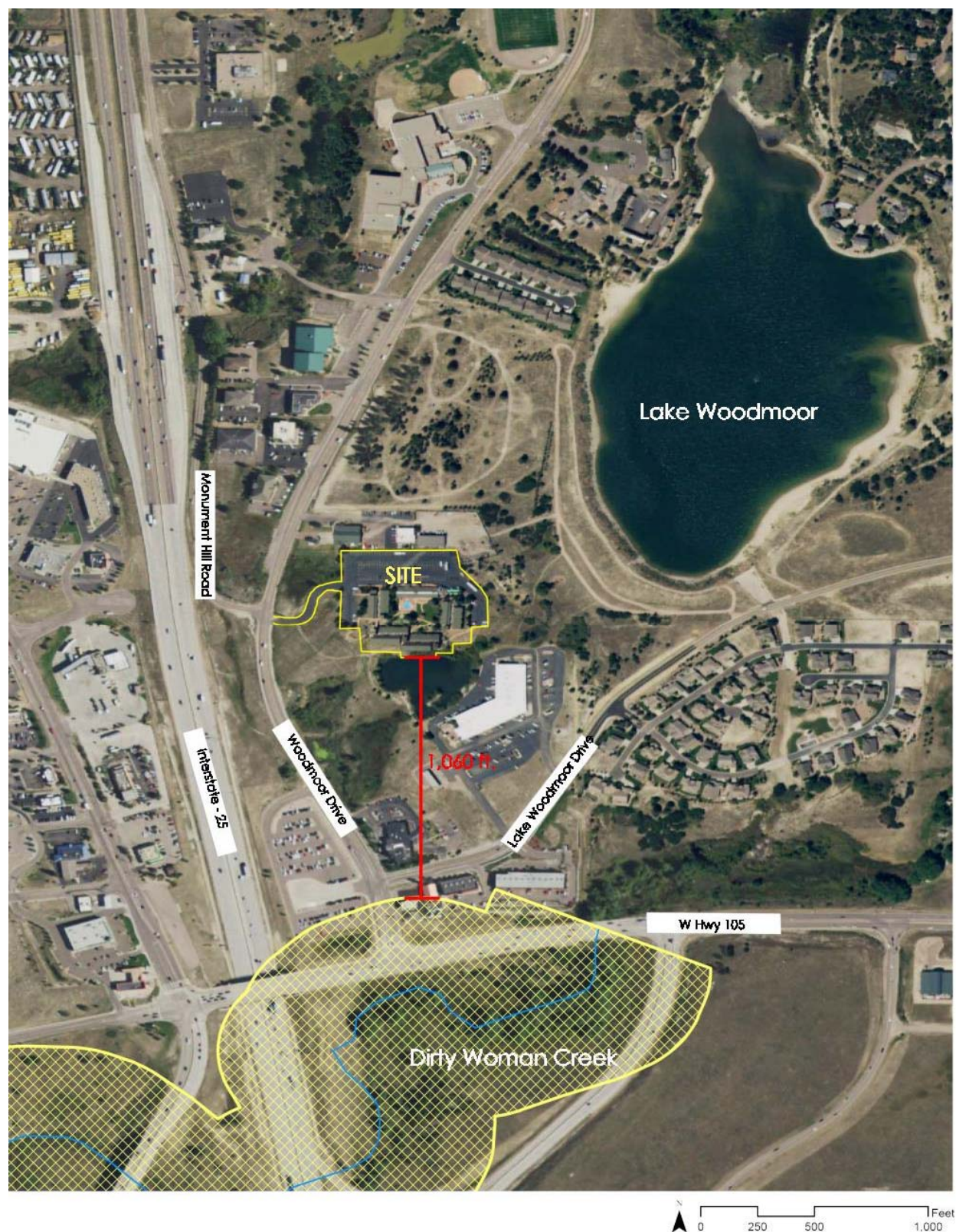
Figure 4. PMJM Critical Habitat (map prepared by N.E.S. Inc.)