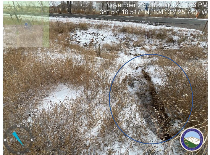
Photo #2 Repair large erosion rill at Bailiff and Judge Orr culvert