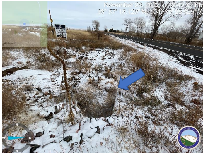
Photo #1 Ditch-out to allow for positive drainage at Bailiff and Judge Orr culvert