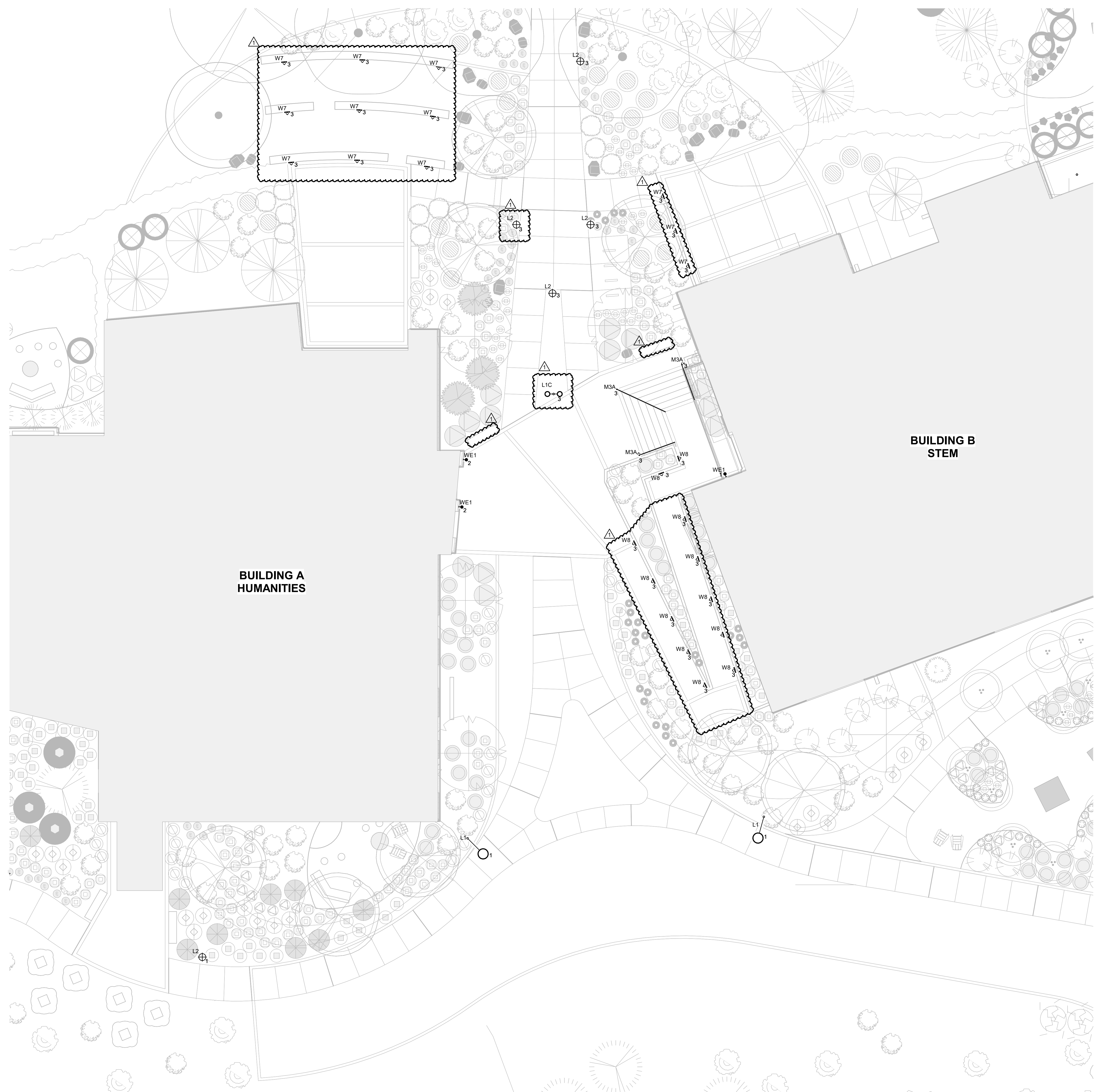
1 ELECTRICAL SITE PLAN PASEO SCALE: 1/8" = 1'-0"