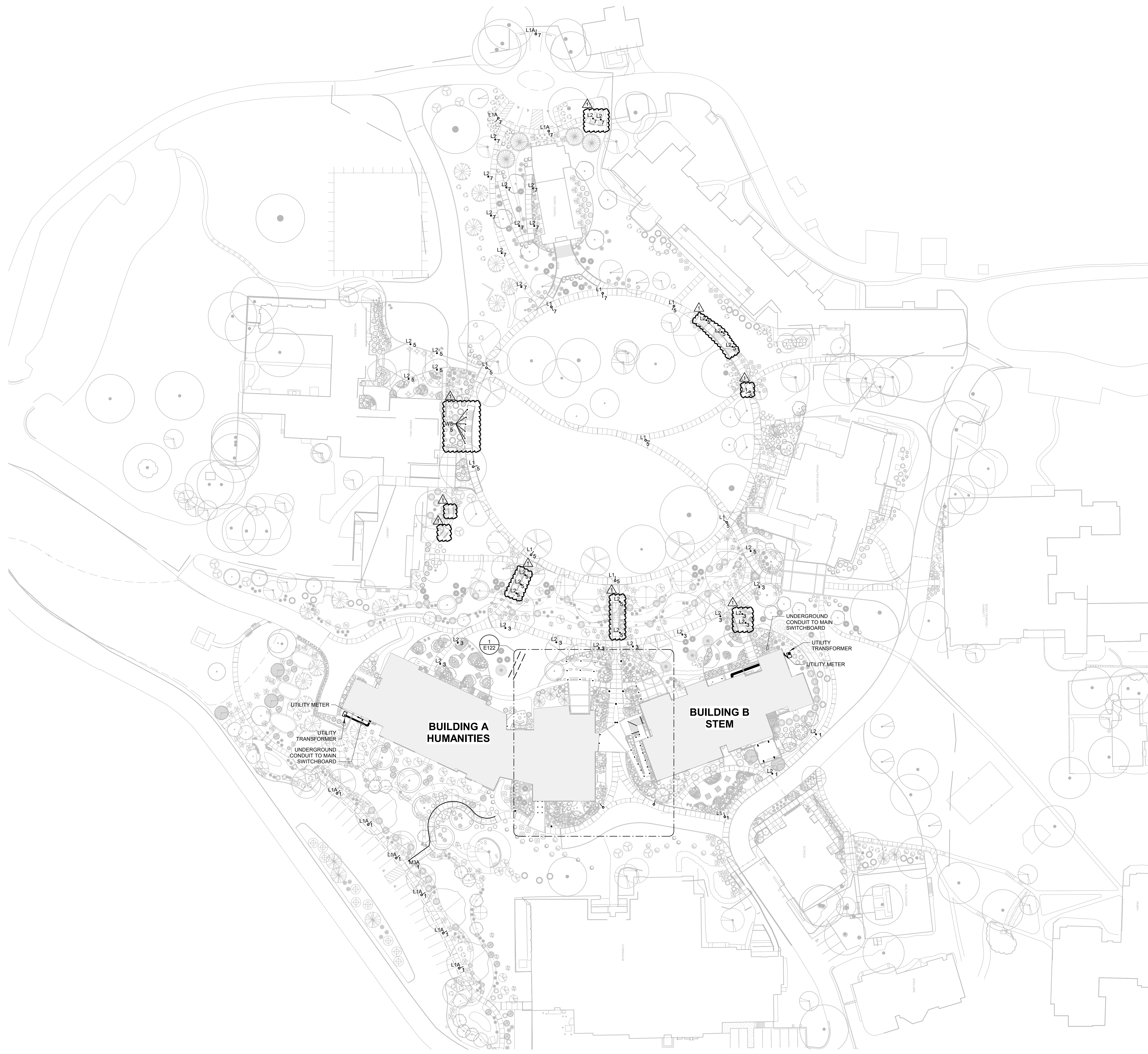
1 ELECTRICAL SITE PLAN SCALE: 1" = 40'-0"