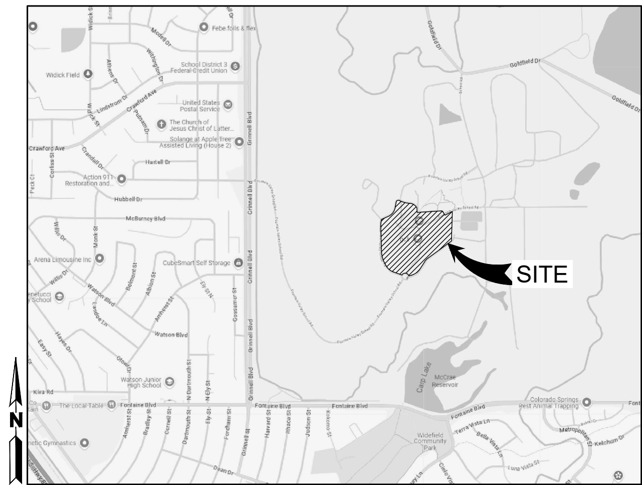
VICINITY MAP SCALE: 1"=500'

SUBJECT TO CHANGE PENDING JURISDICTIONAL APPROVAL