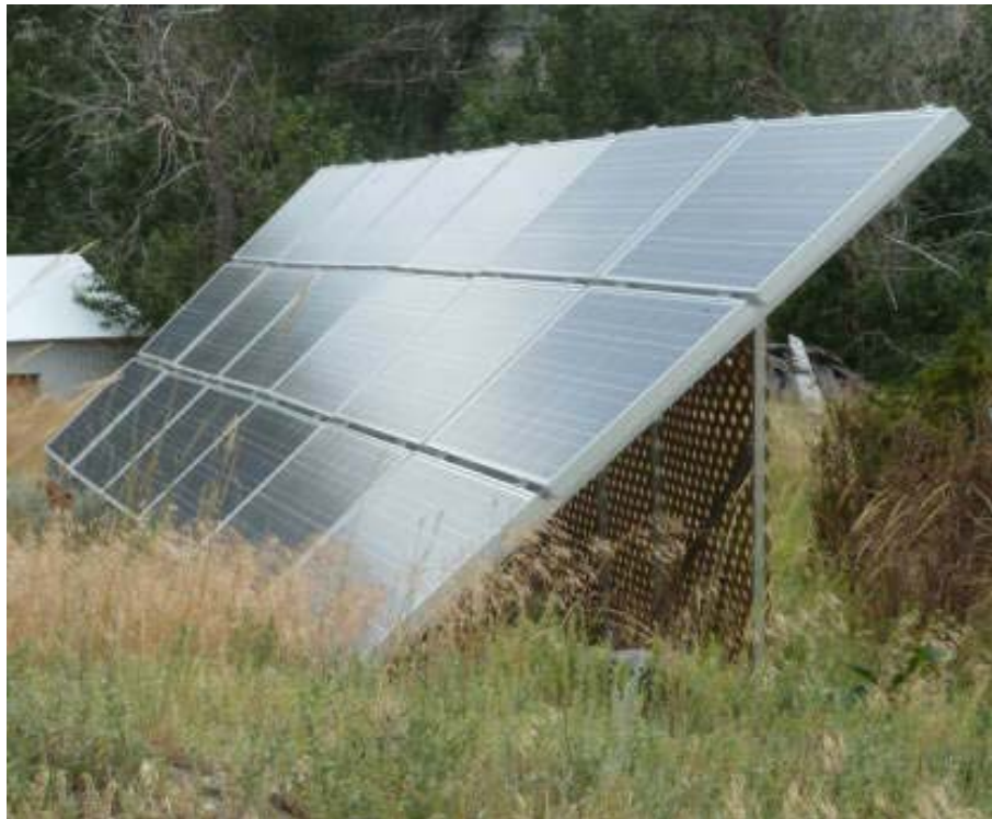
Photo 4. Non-acceptable vegetation management