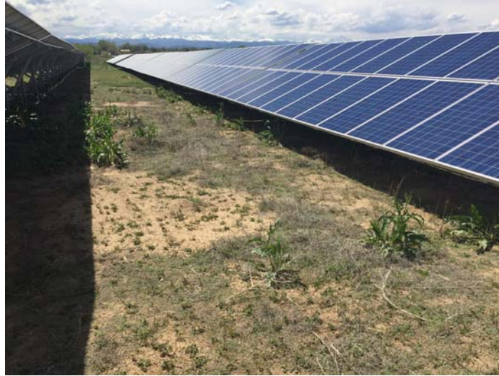
Photo 1. Acceptable Vegetation