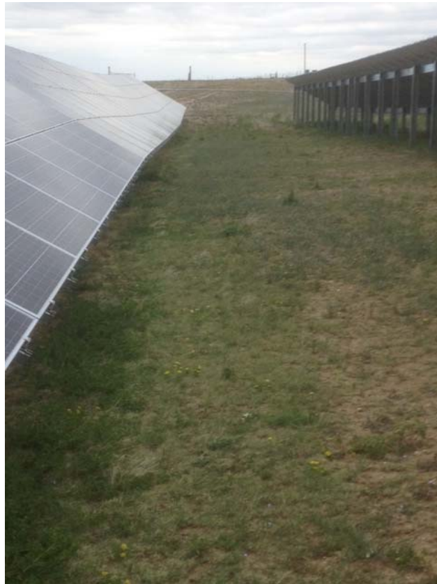
Photo 2. Acceptable Vegetation