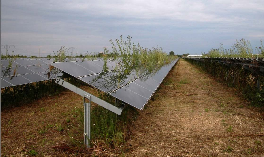
Photo 3. Non-acceptable vegetation management