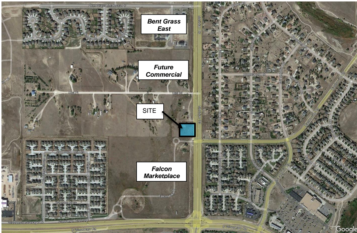
Figure 1 – Project Location

The Project is in El Paso County west of Meridian Road a divided, 4 lane road with commercial and residential uses and north of Owl Place. A proposed self storage facility is proposed to the north, residential lots are located to the west and existing/future commercial to the south. Bent Grass East Commercial is to the north and Falcon Marketplace to the south. The site is currently vacant. The property slopes from the north to the south. The site is mostly native prairie grassland and weeds with trees sparsely located around the site.