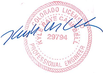
Seal & Signature of P.E.

ml/117560/Letters/CERT STORM – FIL 6.doc