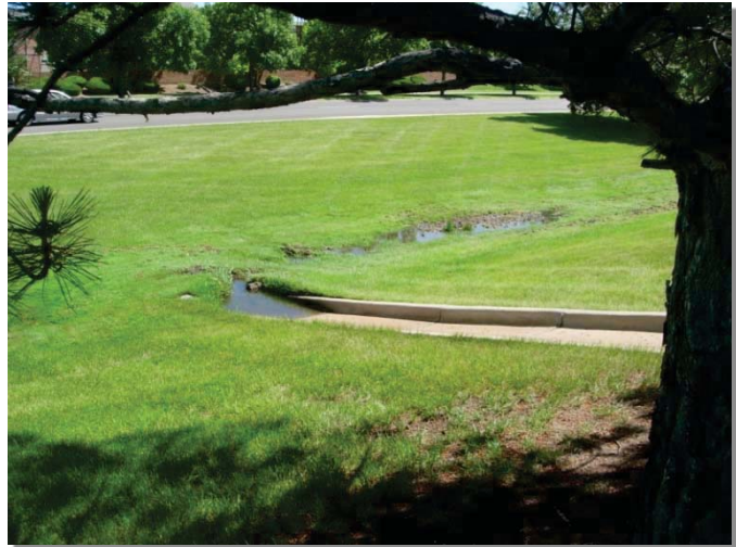
Photograph 6-2. A lack of sediment removal in this grass swale has resulted in a grade change due to growth over the deposition and ponding upstream.

Grass buffers and swales require maintenance of the turf cover and repair of rill or gully development. Healthy vegetation can often be maintained without using fertilizers because runoff from lawns and other areas contains the needed nutrients. Periodically inspecting the vegetation over the first few years will help to identify emerging problems and help to plan for long-term restorative maintenance needs. This section presents a summary of specific maintenance requirements and a suggested frequency of action.