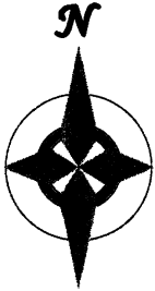
EXHIBIT "B" (pg 2 of 2)