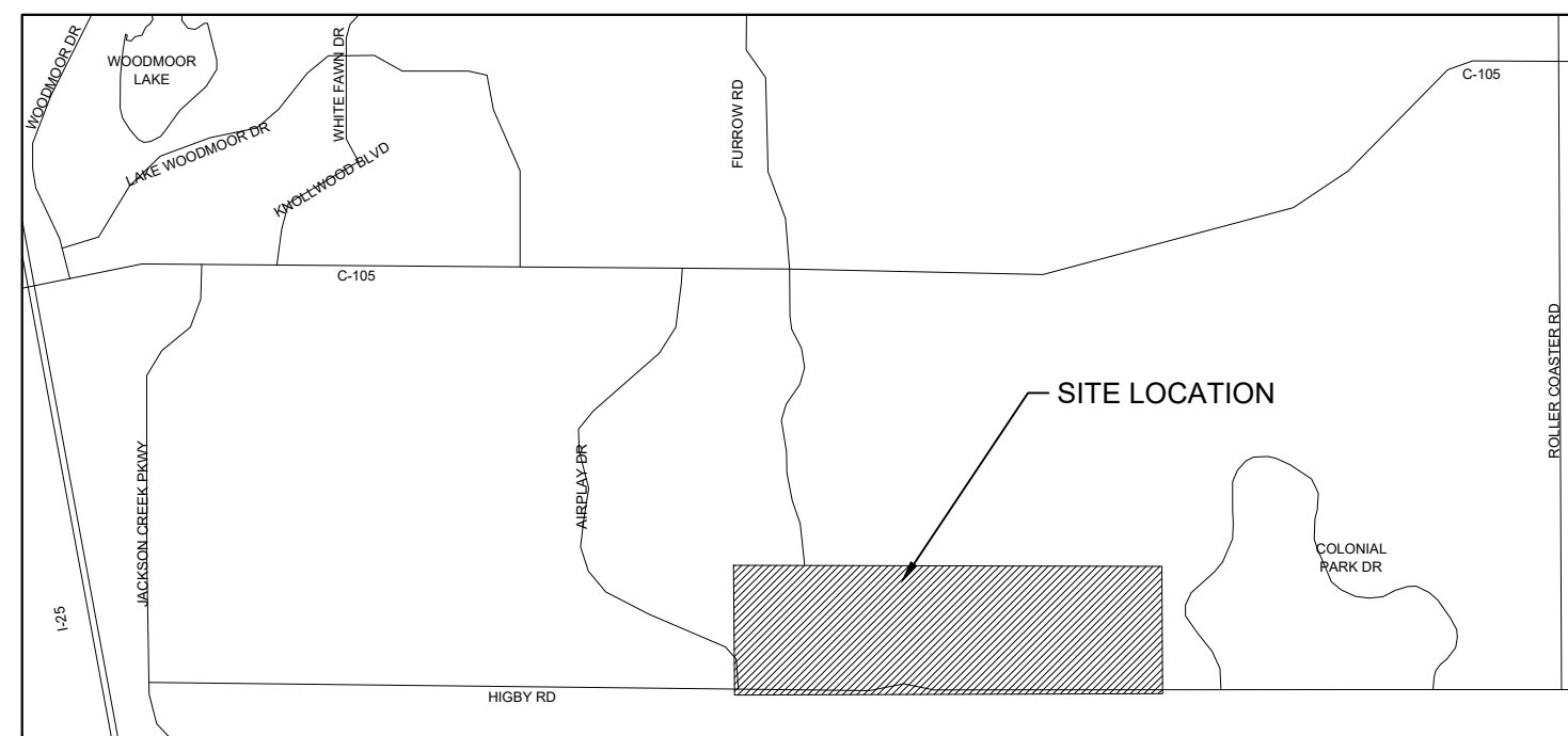
GRANDWOOD RANCH SUBDIVISION THE SOUTH HALF OF THE NORTH HALF OF SECTION 19, TOWNSHIP 11 SOUTH, RANGE 66 WEST OF THE 6th P.M., EL PASO COUNTY, COLORADO, EXCEPTING THEREFROM THE RIGHT OF WAY FOR HIGHWAY ROAD DESCRIBED AT RECEPTION NUMBER 205092691 OF THE EL PASO COUNTY RECORDS.