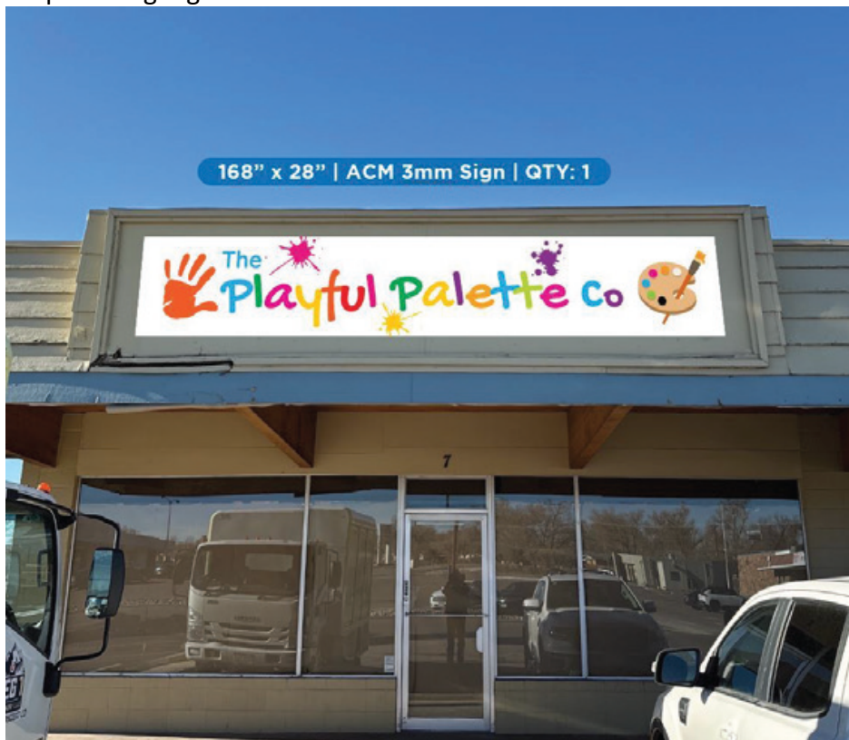
168" x 28" | Aluminum Composite Sign