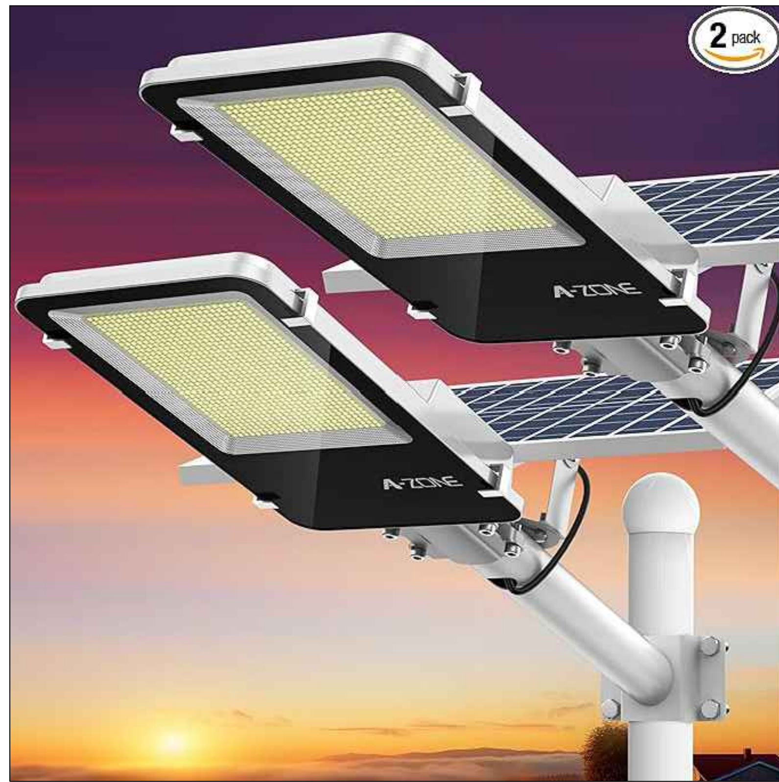
A-ZONE 1200W SOLAR LIGHT

A PORTION OF THE SOUTHWEST QUARTER OF SECTION 15, TOWNSHIP 11 SOUTH, RANGE 65 WEST OF THE 6TH P.M., EL PASO COUNTY, COLORADO EL PASO COUNTY, COLORADO LIGHTING PLAN