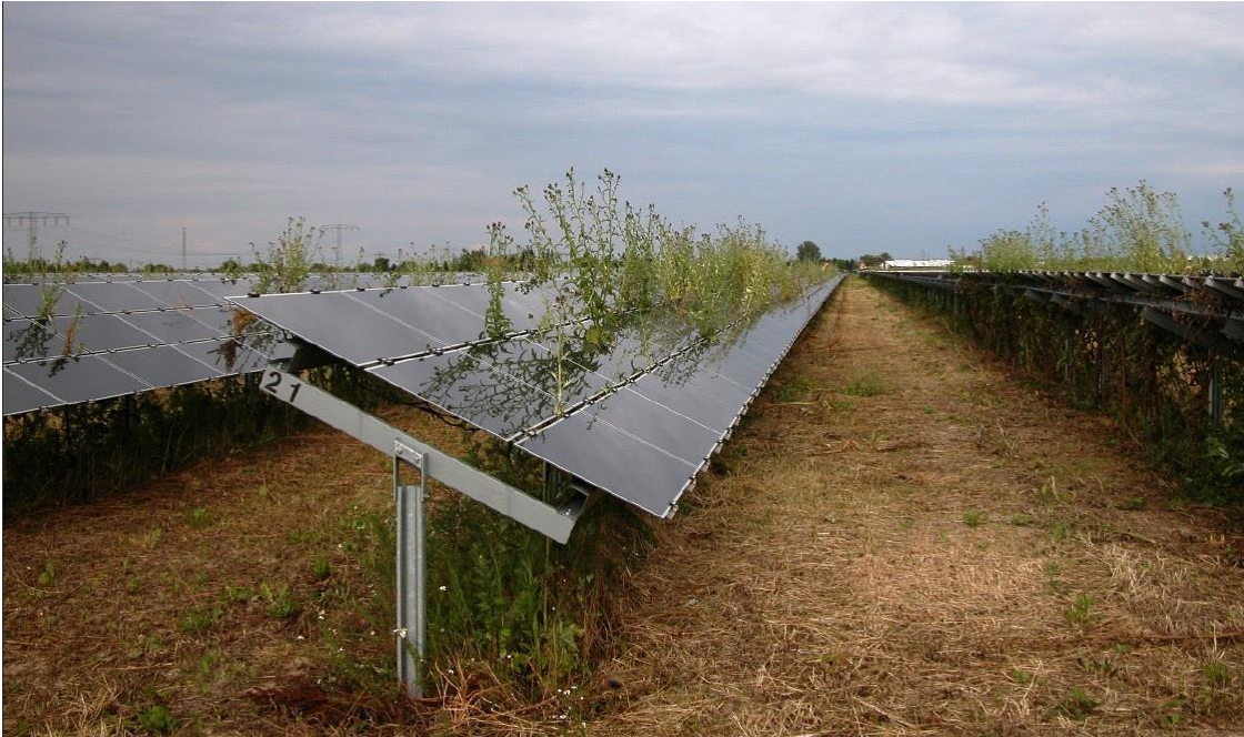
Photo 3. Non-acceptable vegetation management