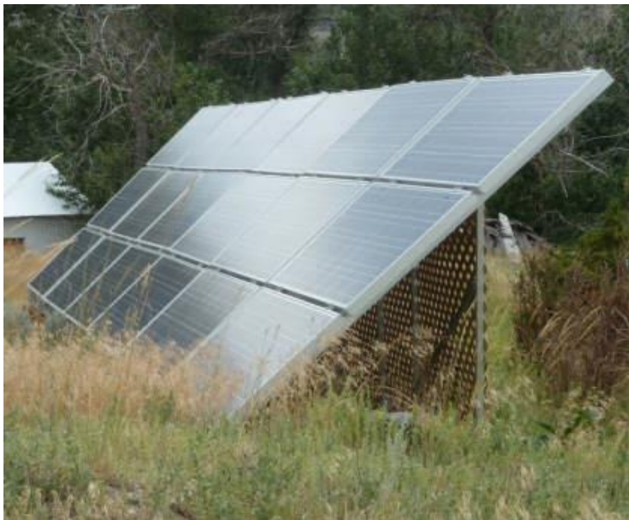
Photo 4. Non-acceptable vegetation management