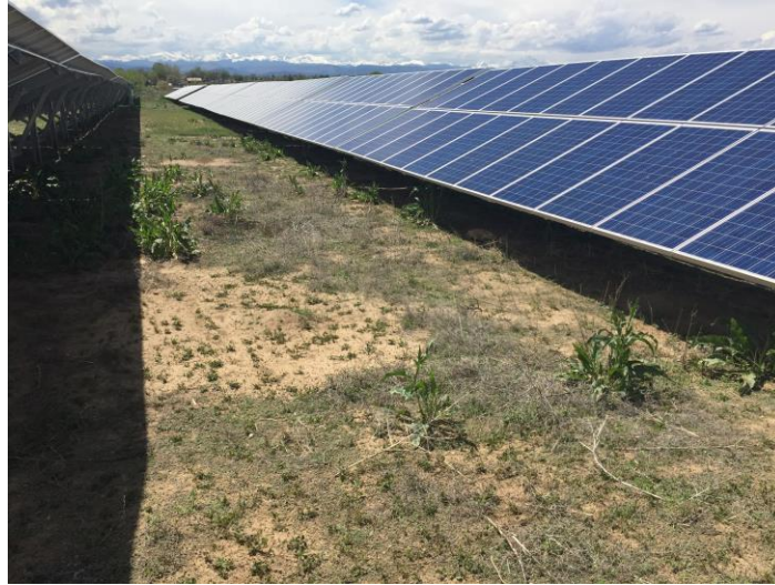
Photo 1. Acceptable Vegetation