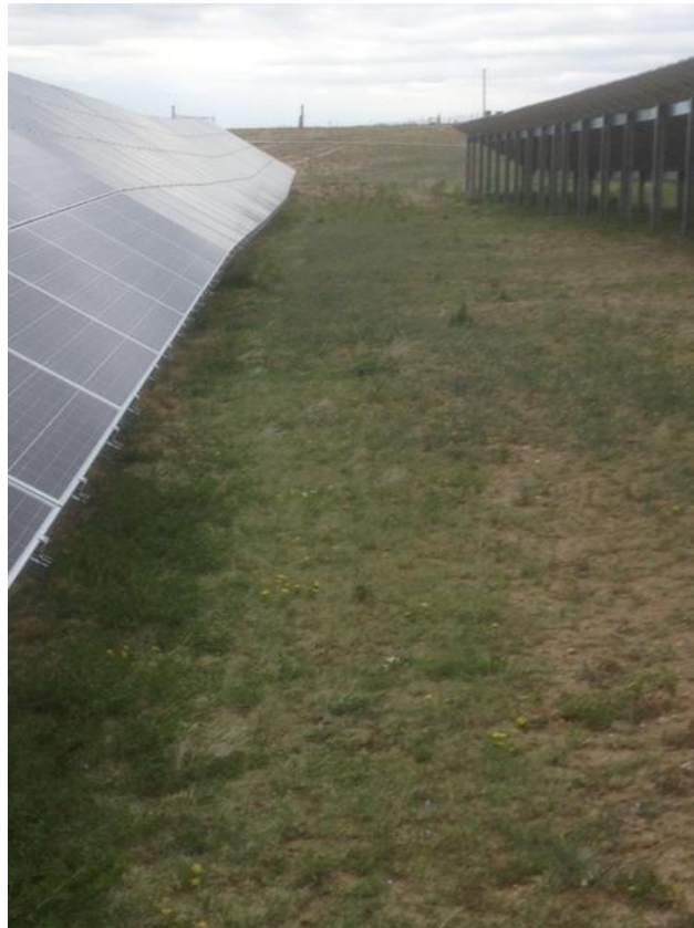
Photo 2. Acceptable Vegetation