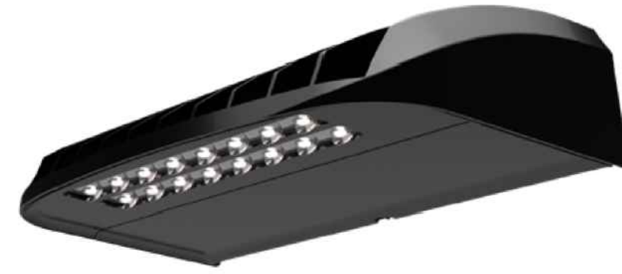
2 XWM WALLPACK (WP1) & (WP2) DP-46 SCALE: NONE