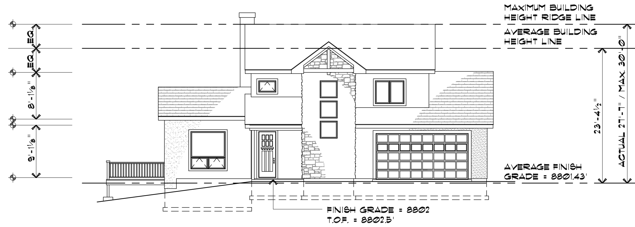
B Building Height Elevation SP1 SCALE: 1" = 10'-0"