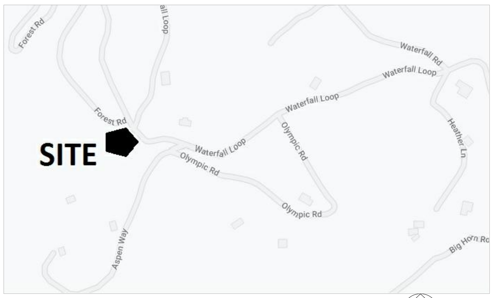
D Vicinity Map SP1 SCALE: NOT TO SCALE