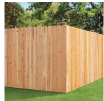
Trash Enclosure Fencing 6' wood privacy fence

Planning & Community Development Director signature _____