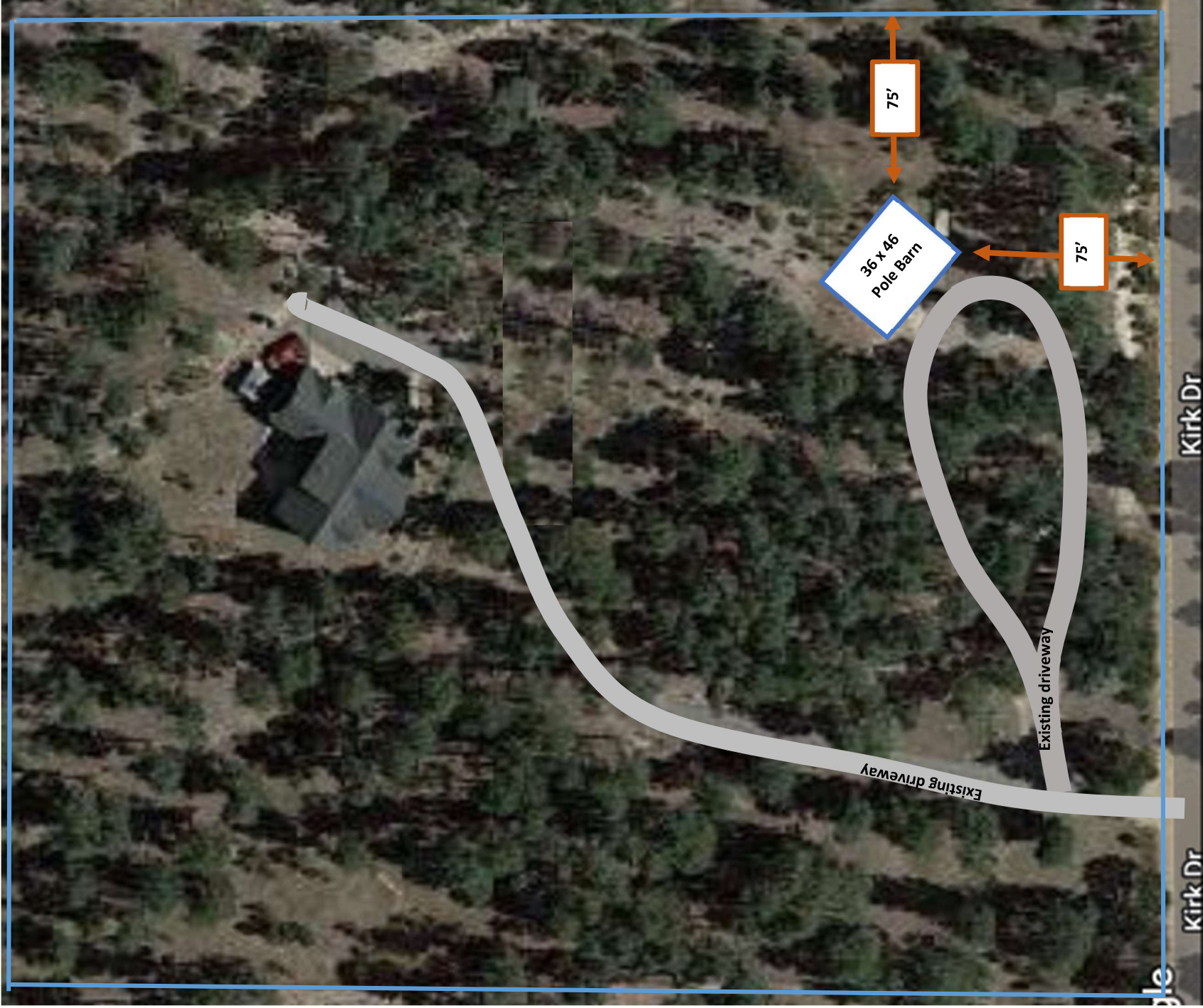
Map 1: Overall property map with barn location