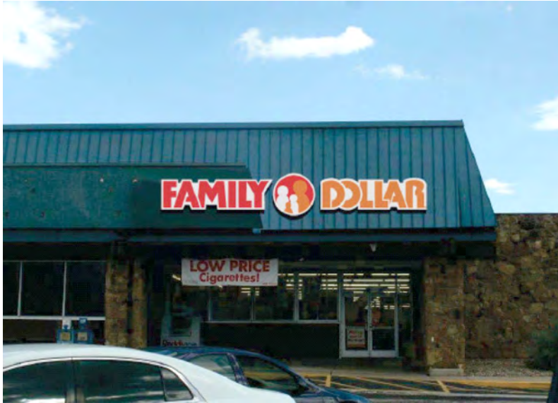
MAIN ELEVATION BEFORE