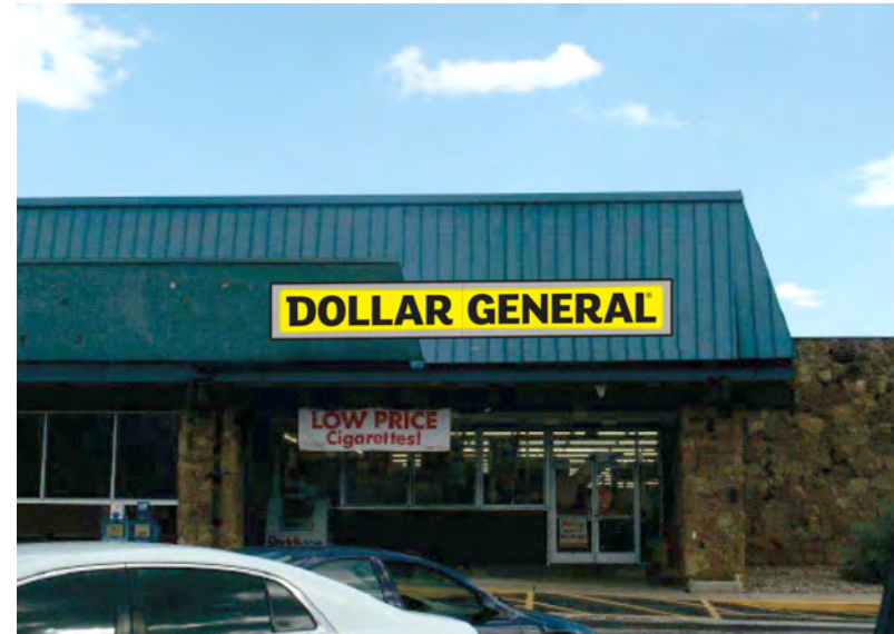
MAIN ELEVATION AFTER