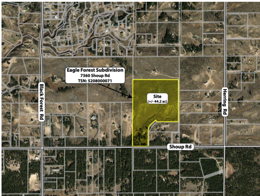
Eagle Forest Subdivision Location

The 44.2 acre property (Parcel Number: 5208000071) is located in Black Forest on Shoup Road approximately ½ mile east of the commercial center of Black Forest at the intersection of Black Forest Road and Shoup Road. The property lies with the Black Forest Protection/Rescue District. Eagle Forest Preliminary Plan was approved by the BOCC on July 27, 2021.